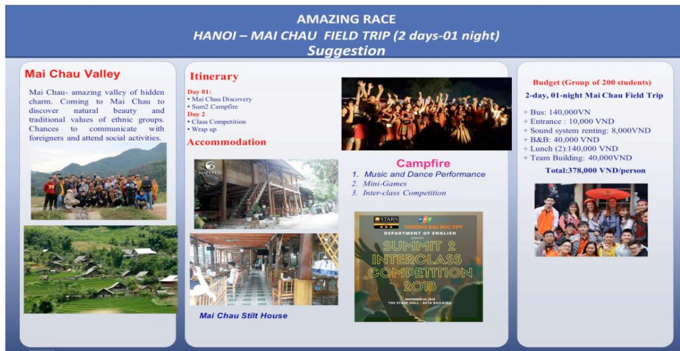
Figure 2: Field Trip Intermarry Ha Noi- Mai Chau, Hoa Binh