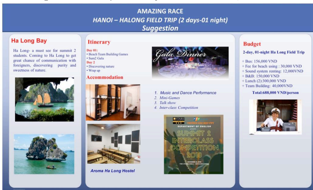
Figure 3: Field Trip Intermarry Ha Noi- Ha Long, Quang Ninh

Preparing textbooks, syllabus: Renovating the contents of the textbooks and syllabus of ESP oriented in real conversations related to real situations of businesses.