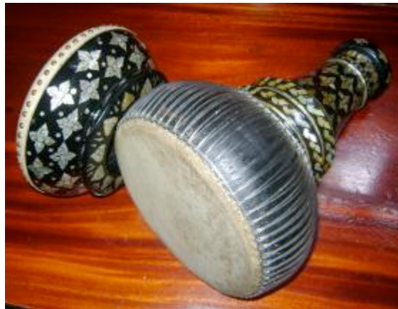
Figure 2 Klong (Ton Rummana)

https://www.youtube.com/watch?v=g5ADF6EIHG4