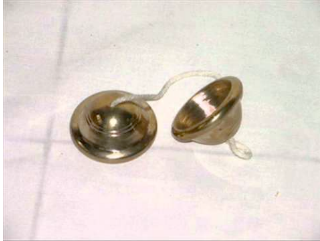
Figure 1 Ching

https://www.youtube.com/watch?v=g5ADF6EIHG4