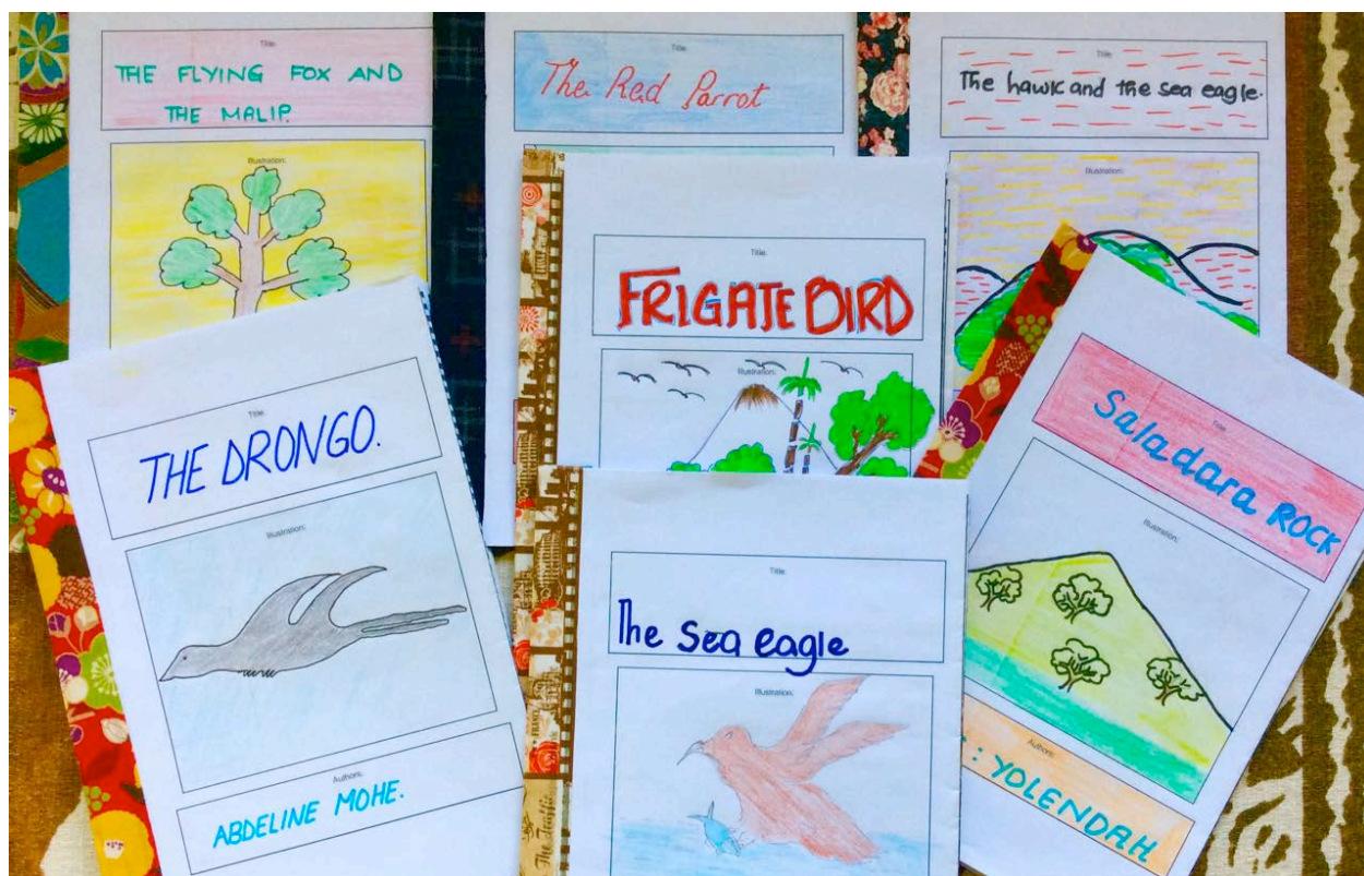
Figure 3: Some of the handmade books developed by the students during the workshop.