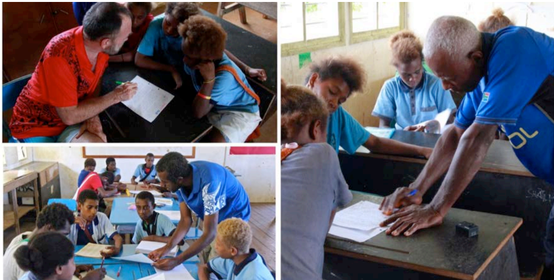
Figure 2: Composition of photos showing students receiving orientations during the correction of their texts. (all photos: da Silva, 2016 - except the image to the left, at the bottom, captured by Volker, 2016).

The presence of both facilitators was also important during the correction of the texts produced by the students, making it possible to optimise the time spent in the classroom and the dynamics in the construction of the narratives, in which it was essential to attend to the students' questions, allowing special treatment for those with some difficulties with writing (Figure 2).