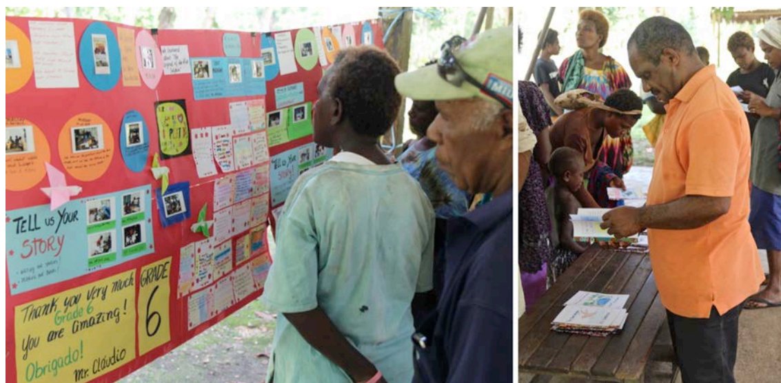
Figure 5: Community members at Luaupul Village observing the material developed by the students during the workshop.

interest in what the students had been doing and could see how the stories and information they had shared earlier contributed to the project.