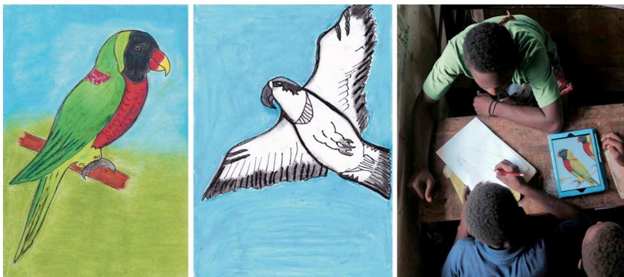
Figure 4: Some of the pictures drew by the students during the workshop.