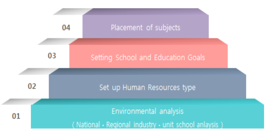
Figure 2: Vocational Education Training Curriculum Development Phase

In order to reform the NCS-based qualifications system, it is necessary to define the qualification criteria for performing the tasks in a specific field based on the NCS.