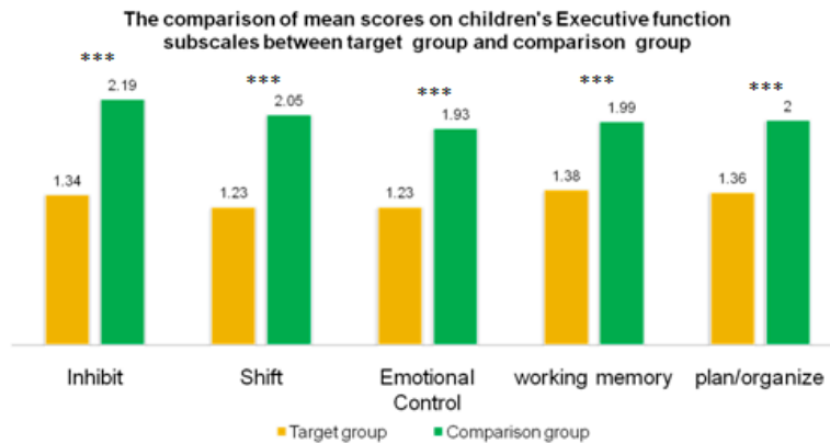
*** p < .001 Figure 2 The comparison between the children in the target group and comparison group on the executive function subscales mean scores

For children's EF, figure 2 presents the comparisons of mean scores of EF subscales between the children in the target group and the comparison group. The children in the target group had significantly lower mean scores on inhibit, shifting, emotional control, working memory, and plan/organize, comparing to the children in the comparison group. It indicated that the children in the target group were more likely to conduct appropriate behaviors related to EF skills, comparing to the children in comparison group.