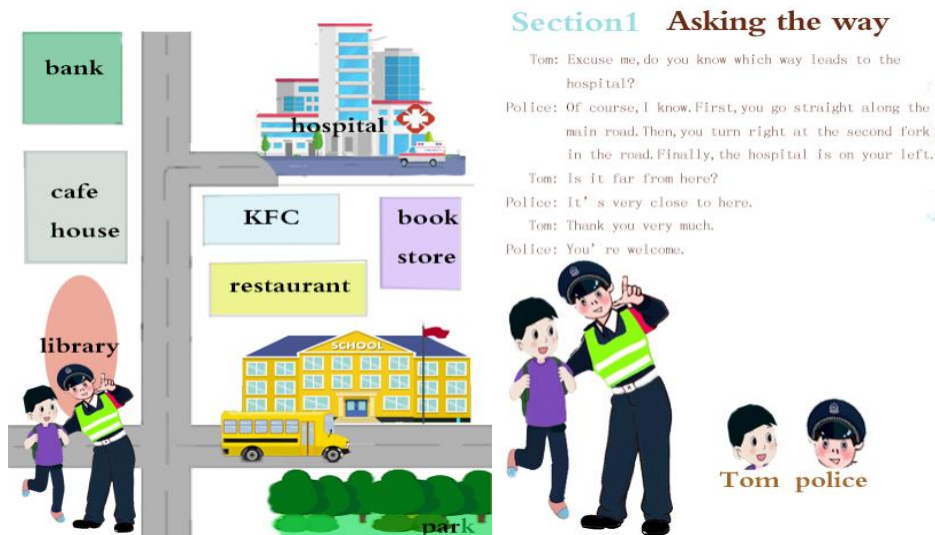
Figure 1: The Example of Career Awareness Comic Book Design