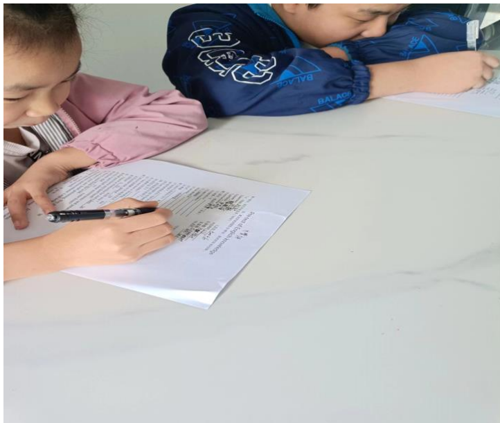
Figure 4: Pre-test Process