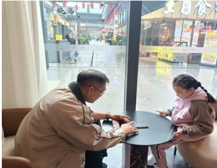
Figure 3: Interview Observation