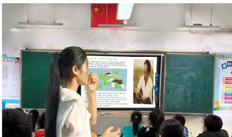
Figure 2: Implement the Teaching Process

The 76 students were divided into two classes, with 38 students in each class. Before the experiment, both classes were given an English test, and both groups were given the same questionnaire. At the beginning of the experiment, a career awareness comic book was used to teach English in two classes for 45 minutes per class, 3 classes per week for 2 months. The teacher dictated 10 words every week. The first 10 minutes of each class are for students' previews and one-on-one Q&A; the next 30 minutes are for teachers' lectures and interactions; and the last 5 minutes are for students' dialogue performances and discussions. If students discuss questions in the last 5 minutes of class, the teacher will answer them one-on-one in the first 10 minutes of the next class. Observe students every two weeks to learn about their classroom experience and to improve the classroom teaching plan. After the completion of the experimental teaching tasks, two classes of students conducted a questionnaire survey. During the experiment, the researcher will control the experimental conditions precisely, ensure the consistency of the experimental environment, teaching content, and teaching method, so as to reduce the interference factors in the experiment. The experimental process is shown in the following figures.