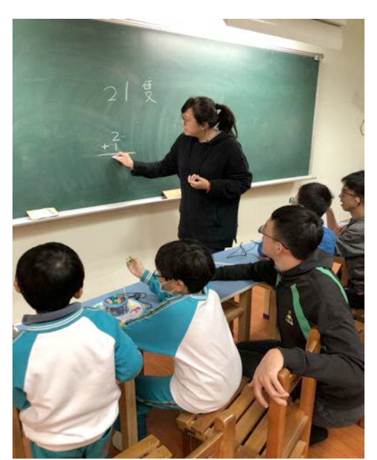
Fig. 10 Game Explanation

Initially, a simple one-digit addition question (2+1=) was written on the blackboard for demonstration. After it was certain that the participants really understood the game and how to operate the toy, the actual teaching began and questions were given (see Fig. 10).