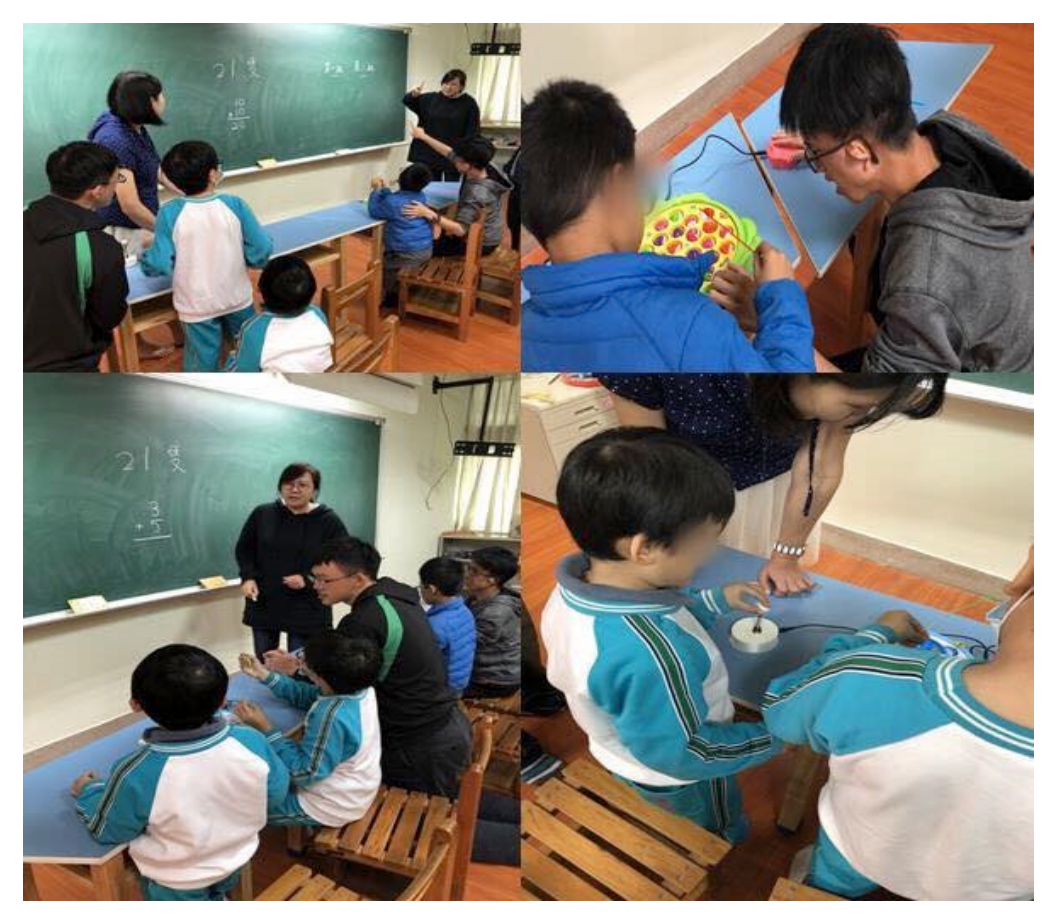
Fig. 11 Students Operating the Fishing Toy under Assistance and to Engage in a Competition

for pressing the special switch had to continue to press the switch for the fish to turn and open their mouths, so that the one in charge of fishing could catch the fish (see Fig. 11).