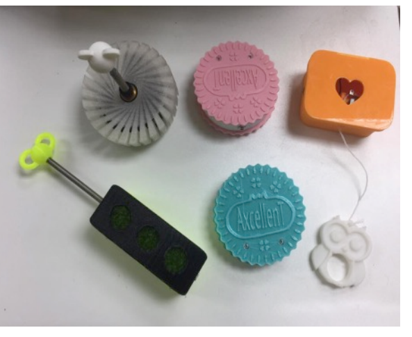
Fig. 2 Various Switches