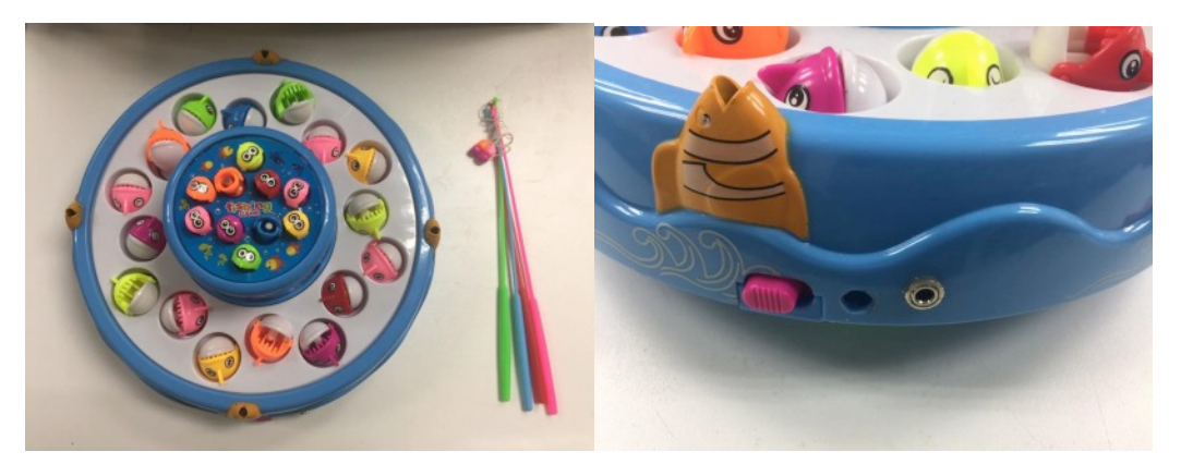
Fig. 4 Toy Modification

The power source for the motor of fishing toys available on the market was modified (see Fig. 4), so that a special switch could replace the power source and the toy could be activated by pressing the special switch