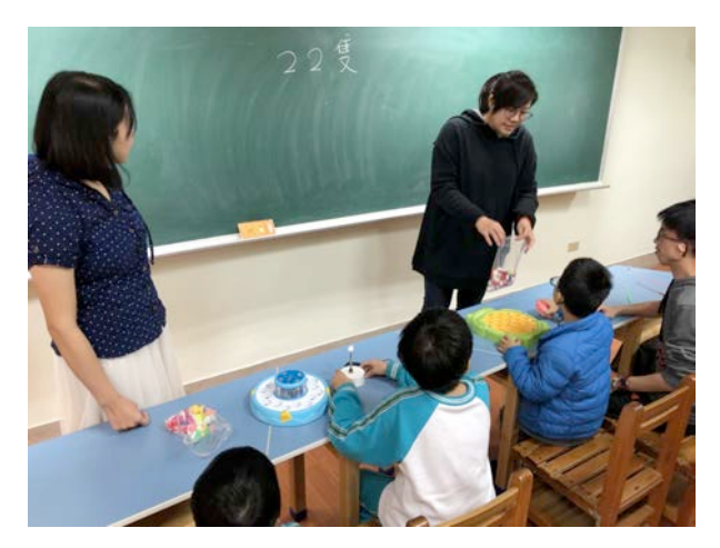
Fig. 8 Game Explanation

Due to the disability and age of the participants, the game was explained without using difficult words. Simple and structural explanations were given to assure the participants could fully understand the rules of the game and how the game should be played (see Fig. 8).