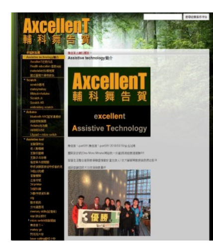
Fig. 1 Axcellent website

The team called Excellent Assistive Technology, AxcellenT for short (see Fig. 1), created by the graduate institute the authors are attending designs and produces various special switches in accordance with the conditions of different children with special needs, including push switches, wobble switches and pull switches (see Fig. 2). Such special switches are pressed to activate modified toys. In this study, the participants had to activate modified toys through teamwork to execute their missions. In order to help more children with special needs, AxcellenT offer the public to use its special switches design for free service (see Fig. 3).