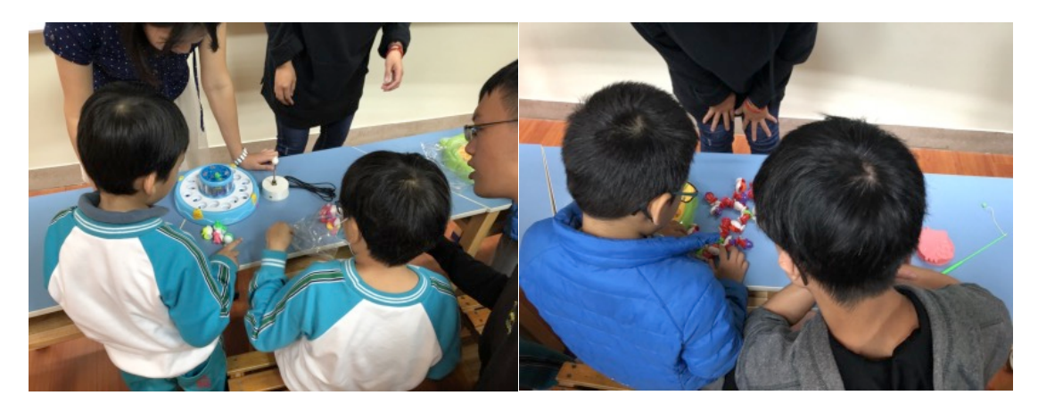
Fig. 7 Students Counting the Quantity of Fish in the Fishing Toy under Guidance