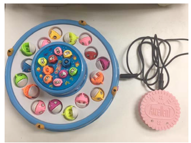
Fig. 5 A modified Toy and a Special Switch Connected with an Audio Cable