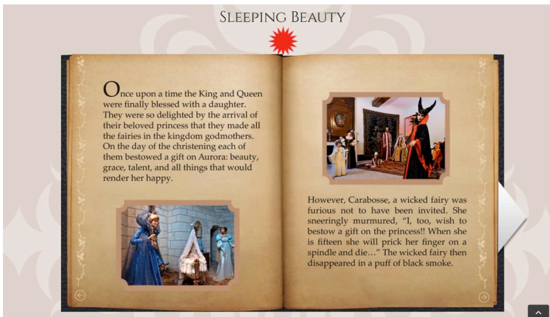
Picture 4: Illustrated eBook with pictures of the fairy tale