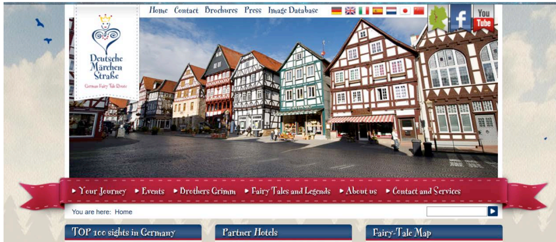
Picture 1: The German Fairy Tale Route website, English version (source: http://www.deutsche-maerchenstrasse.com/en/?lang=en_US )

The German Fairy Tale Route or Märchenstraße is a tourist attraction established in 1975. The route begins in the south with Hanau, the birthplace of the Grimm brothers. The 600 kilometers long route ends in Bremen, which is associated with The Town Musicians of Bremen. According to a blog at itinerariesnow.com , the best period to travel on the route is from April to October; it takes around a week.