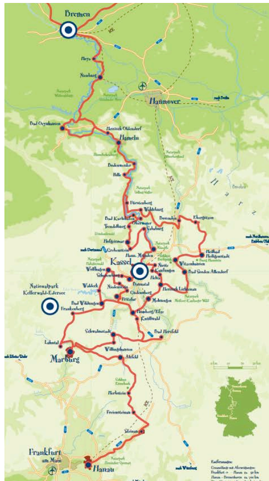
Picture 2: The German Fairy Tale Route

The 200 th anniversary of Children's and Household Tales was observed in 2012-2013 in Germany with a series of open-air festivals, exhibits, and performances related to the Brothers Grimm and fairy tales.