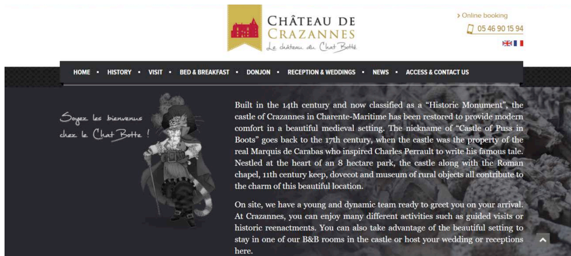
Picture 6: Illustrated webpage of Crazannes with mention of Puss in Boots

According to Crazannes's website (see picture 6 above), Jules Gouffier was the inspiration for Perrault's tale, but it is certainly a mistake. Jules (born in 1636) was comte of Passavant, but not of Caravaz (Moréri, 1759, 296).