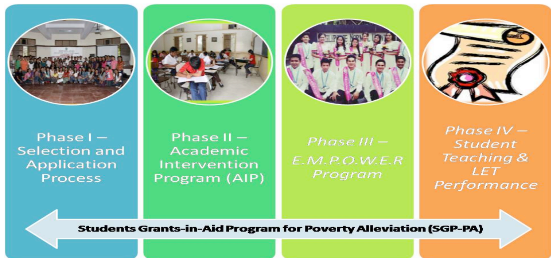
Figure 2. The PNU SGP-PA Program

Effective intervention programs are based on developmental approach model (Borders & Drury, 1992). A developmental program is proactive and preventive, helping students acquire the knowledge, skills, self-awareness, and attitudes necessary for successful mastery of normal developmental tasks. There is also substantial empirical evidence that these programs promote student development and academic success (Borders, 1992). It is through this idea that the PNU SGP-PA Program was conceptualized and developed for implementation.