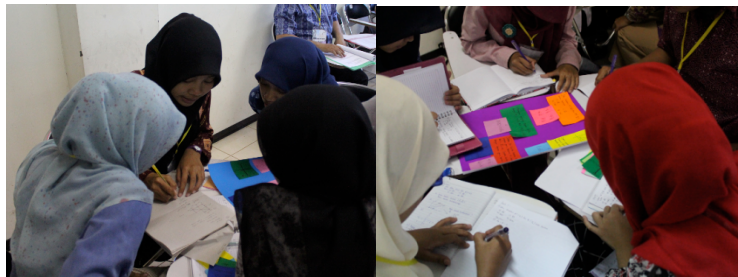
Figure 4. students determined what should be done if it is not quite finish yet Once students are done, check to make sure the numbers really work by plugging them back into the original conditions. The alternative answers that have been obtained by each group has a different way of reference and different for each group. So when it has a difference by each group of lecturers need to consider whether the means used was appropriate or not. Restore step by step do need to figure out which one has the most appropriate alternative answers.

If students are close to their number but not quite there yet, determine what should be done. The process of finding alternative answers needed timeless, if its given time has run out while the student has not completed the given problem lecturer, then students need to correct myself whether management has owned the right time or not. So not only have good cognitive abilities but time management and division of tasks between the groups also need to be considered by each group of student learning.