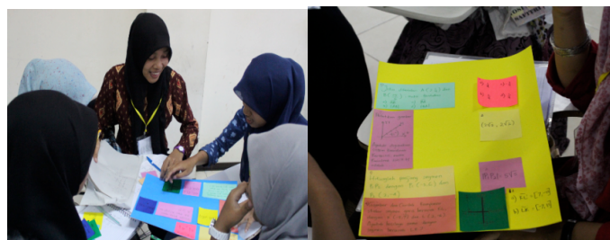
Figure 5. Students check their final answer

Figure 4. students determined what should be done if it is not quite finish yet Once students are done, check to make sure the numbers really work by plugging them back into the original conditions. The alternative answers that have been obtained by each group has a different way of reference and different for each group. So when it has a difference by each group of lecturers need to consider whether the means used was appropriate or not. Restore step by step do need to figure out which one has the most appropriate alternative answers.