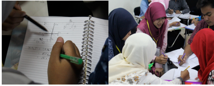
Figure 3. students try out a number

If students are close to their number but not quite there yet, determine what should be done. The process of finding alternative answers needed timeless, if its given time has run out while the student has not completed the given problem lecturer, then students need to correct myself whether management has owned the right time or not. So not only have good cognitive abilities but time management and division of tasks between the groups also need to be considered by each group of student learning.