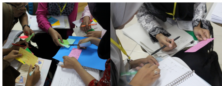
Figure 2. students determined what they are comparing to

Determine what number students are comparing to. The results of what they get together group of their friends then compared with the results conducted by other groups, whether of the discussion draft is done and the results of the search of alternative answer to the problem is provided. This process needs to be done so that what they do does have a truth value or not