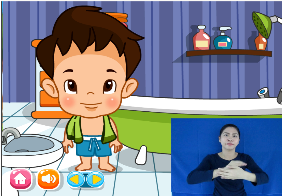
Figure 4. Content about story