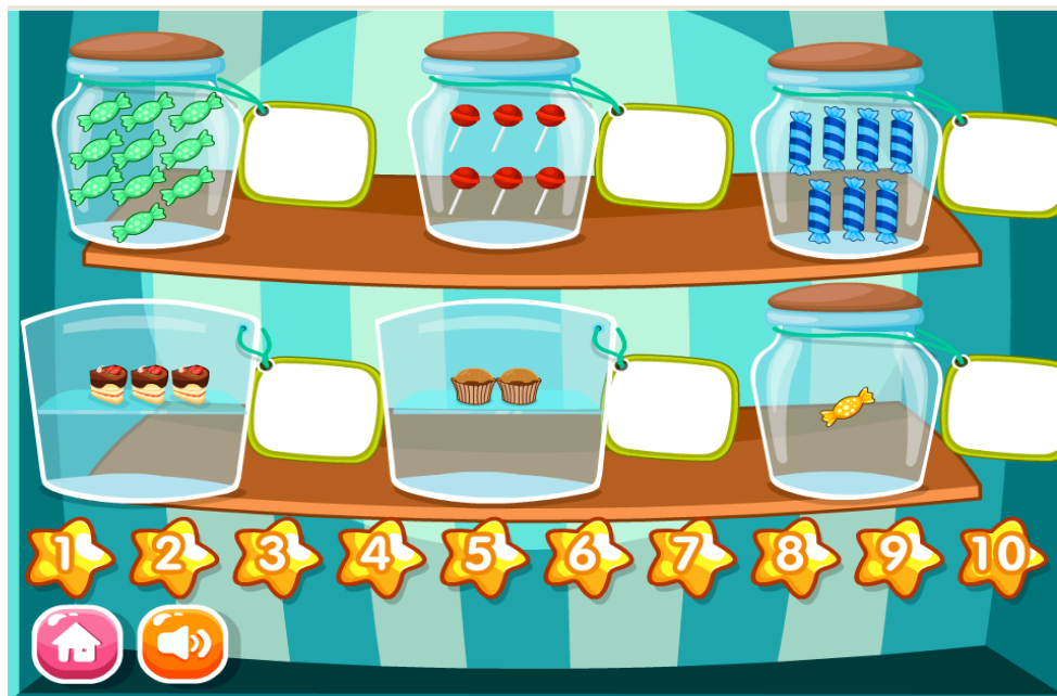
Figure 6. Content about exercises