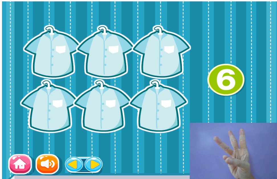
Figure 5. Content about counting sign language