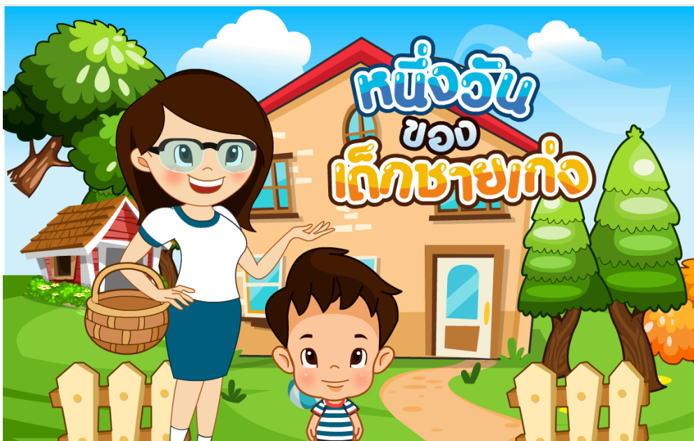
Figure 2. Content Screen Title

This study follows the multimedia storytelling book design framework for the guideline in developing the prototype. This study examines the effect of multimedia use on hearing impaired children’s ability to learn math using a multimedia storytelling book. During the development of the prototype, each step was tested with hearing impaired students who were the targeted users. The results of the testes were evaluated by teachers in the deaf school. From the evaluations, the strengths and weakness of the prototype were accessed and the comments by the teachers were used to improve quality and flexibility of the users. Formal evaluation for the complete prototype was conducted. Example of the prototype are shown in Fig2 , 3 ,4 ,5 and 6.