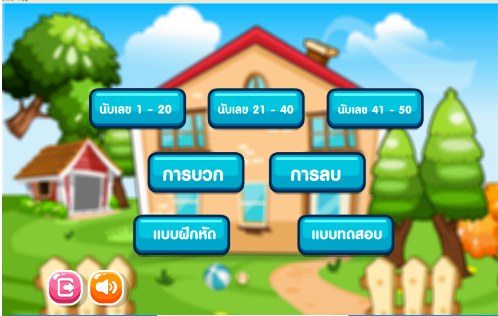
Figure 3. Content about menu