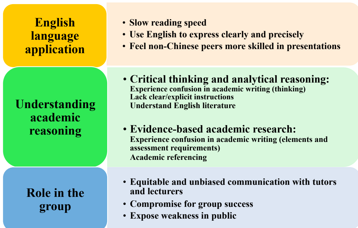
Figure 1: Nature of the challenges/different experiences during Chinese international students' study in the UK

Based on the identified patterns in the experiences of Chinese international students in the UK, I further categorised their experiences into three groups according to the nature of each statement: English language application , Understanding academic reasoning , and their Role in the group . This classification helped to offer valuable insights into the cultural factors influencing their UK study experiences.