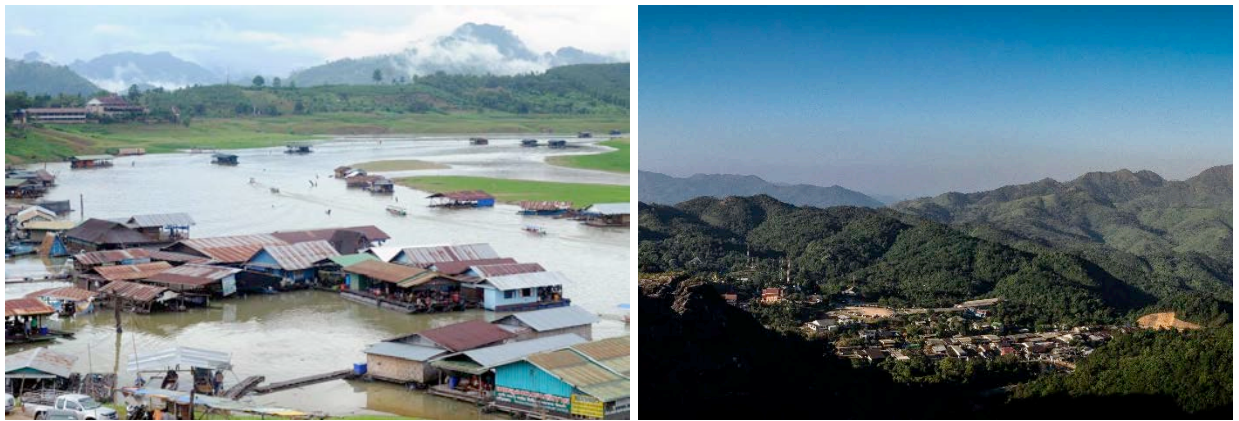
Figure 4: The surrounding of Sangkhlaburi (left) and Thong Pha Phum (right) districts