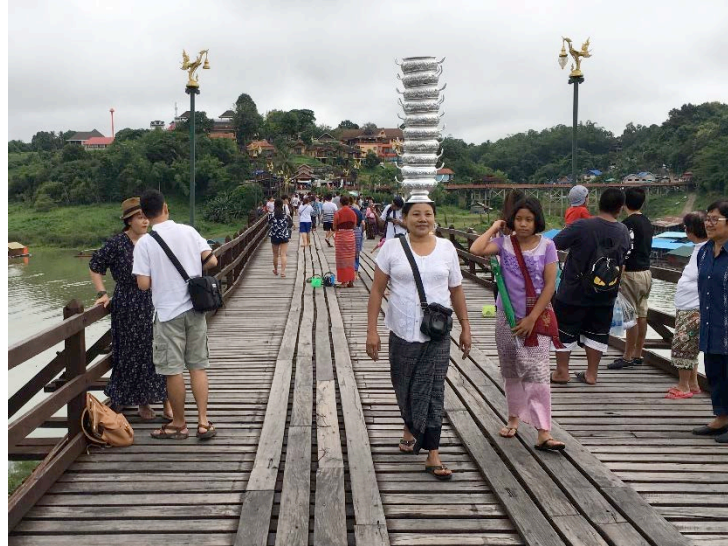
Figure 2: Mon Bridge

donated and supported his attention to build a bridge for connecting the relationship between Mons in Kanchaburi and Mons in Wangka villages known as 'Mon Bridge or Sapan Mon in Thai'. Nowadays, the Mon Bridge is one of the most attractive landmarks of Sangkhlaburi which visitors define it is the main destination to visit there.