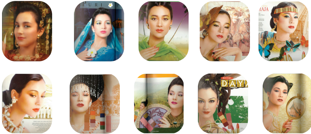
Figure 8. Models as main images in SARIAYU advertisements.