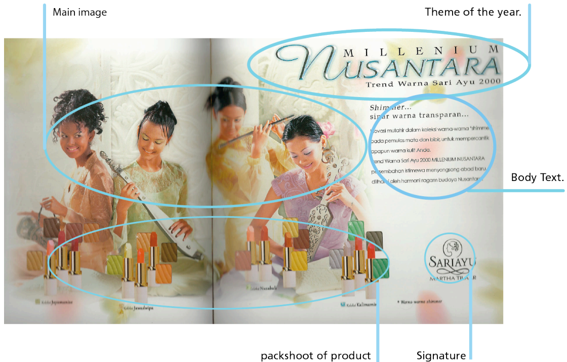
Image 3. SARIYU Ad in 2000 featuring 4 models.