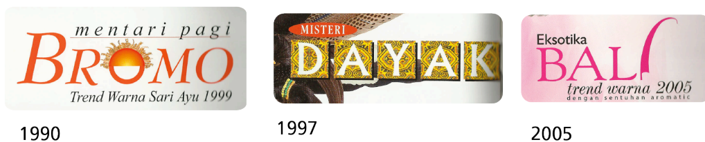
Figure 4. Stylized headlines examples.

The specialized typography for theme of the year is always stylized with elements from the featured culture. For instance the Mount Bromo theme in 1990 has replace the letter 'o' with representation of the sun, because Mount Bromo is popular with its magnificent sunrise. While in 1997, traditional Dayak motif were used to enhance the word 'dayak'. In 2005, SARIYU used traditional Balinese flag to replace the letter 'i' (image 4.) This tendency is practiced since the 1990's.