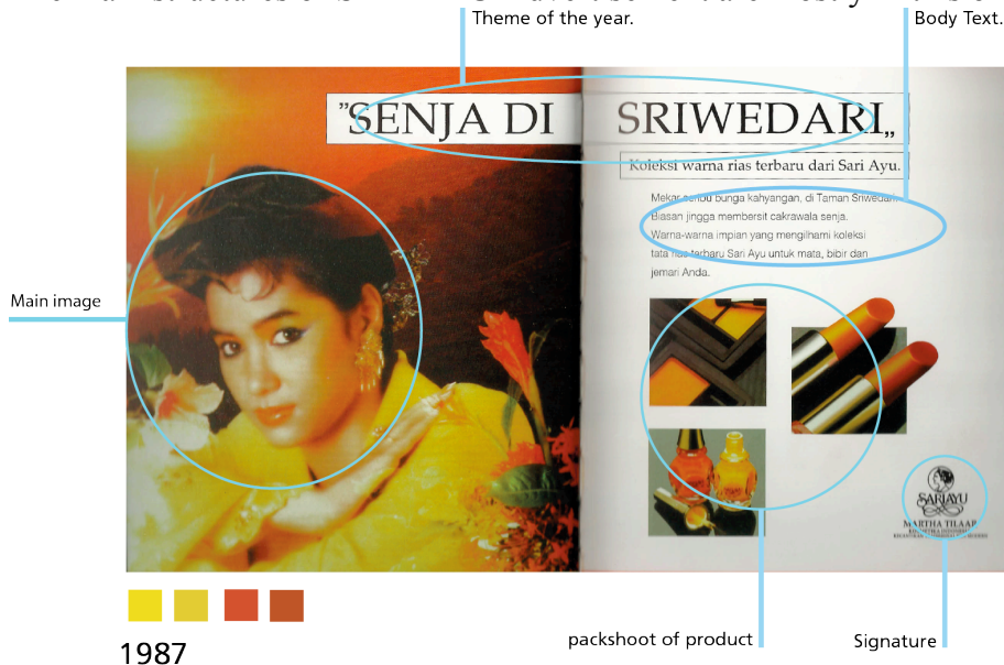
Image 1. Advertisement structure.

The main structures of SARIAYU Advertisement are mostly in this order: