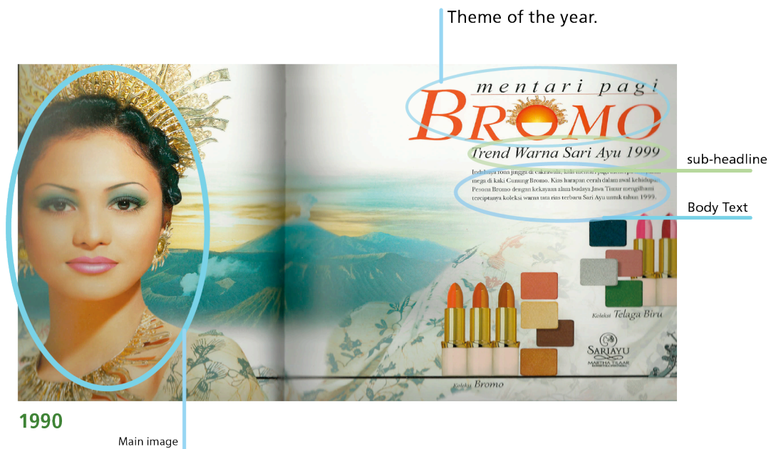
Figure 5. The typical typography structure in SARIAYU advertisement.