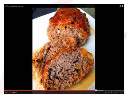
Ill.6: Frame grab IVF 16- Our Experience ~Beta level

Orchestrations of the everyday life, and close visual encounters of the couple in emotional distress and pain, add gravity to the fertility project mediated countering the optimization of the infertile body letting space, time, and modality characterizing the everyday at the fore. In front of a transportable camera or webcam infertile couples talk and move around in their home, cars and clinical surroundings before, during and after the IVF treatments. In IVF 16- Our Experience ~Beta level (Ill. 6) a photograph from everyday life of a meatloaf sets the stage for involvement. The haptic quality of the meatloaf affectively involves the viewer in the state of Silvia's post injected butt.