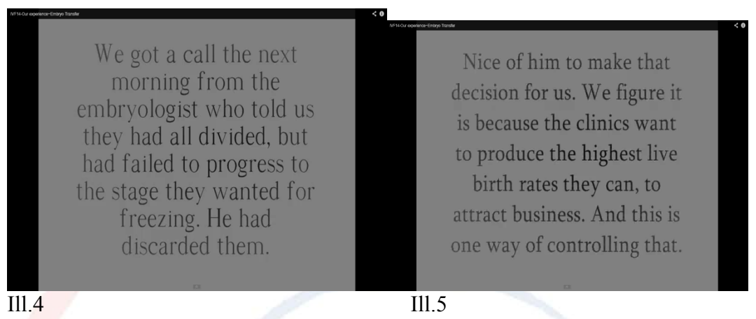
Ill.4& 5: Frame grab from IVF 14-Our Experience ~Embryo Transfer

discrepancy converges with Japanese debates on similar matters as noted by Kato and Sleeboom Falkner (2011).