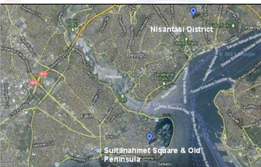
Figure 1&2: Sultanahmed Square and the Nisantasi District

The plans for the Fountain were first presented to Ahmet Tevfik Paşa, the Minister of Foreign Affairs of the time, during a reception in Wilhelm's palace in Berlin on January 15<sup>th</sup> 1900. Ahmet Tevfik Paşa described the Fountain as being in the Byzantine style, which was used in Germany at the time, with traces of Arabian architecture. His detailed description is almost identical with the finished monument. He also notes that an inscription about the Fountain being a gift to commemorate Emperor's visit to Istanbul and a sura from Koran about water would be placed on the Fountain. Because all the building parts were going to be prepared in Germany, these inscriptions were supposed to be written in Istanbul and sent to Berlin to be engraved.(İDH, 2010, 176-178)