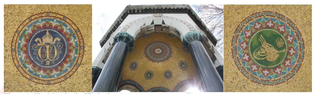
Figure 4: The Mosaics inside the Dome

a line of star motives on the either side of these medallions. Adornment with mosaics is surely a complementary choice in a building of Byzantine style, as it can be seen in the German neo-Byzantine buildings of the time, but some sources explain this also as a choice born out of respect to the Islamic tradition of non- figurative drawings. (Fındıkgil-Doğuoğlu, 2001, 248)