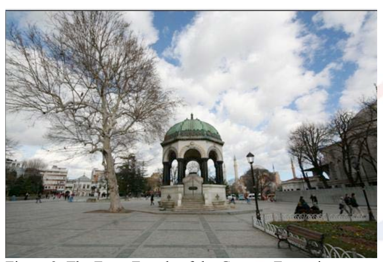
Figure 3: The Front Façade of the German Fountain

The Fountain has a simple octagonal plan. It consists of an elevated platform, which can be entered from the southern facade looking to the square. This entrance and the stairs leading to it defines structure's front facade. (Figure 3) All the other sides have faucets cast in bronze and marble basins. It is mostly made out of white marble, except the columns, which are of green granite and the construction components made out of bronze casting. The column capitols and bases are also bronze cast and have floral engravings. These columns situated on the platform carry the ripped dome through circular arches. The dome itself is covered with copper with a bronze cast edging.