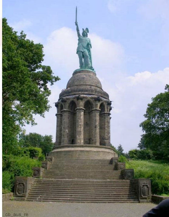
Figure 6&7: The Wilhelm Monument in Porta-Westfalica & Hermann Monument in Teutoburg Forest

A good example of baldachin formed German monuments is the Monument in Porta-Westfalica, which was commissioned right after the death of Wilhelm I. in March 09<sup>th</sup> 1888. (Figure 6) The Monument shows clearly the idea of communicating with the past heroes and victories in its resemblance of Hermann Monument in Teutoburg Forest. Both monuments have a similar design with a base structure with a circular plan, a dome supported by round arches and strong pillars and their name sake rulers sculpture dominating their architecture. (Dolgner, 1993, 109-112)(Figure 7) This sculpture of Wilhelm I. also shows the sacralization of the Monument and Wilhelm I. himself in its form which shows Wilhelm raising his right hand as if giving his blessings. The baldachin form strengthens this sacralization with its resemblance to a tabernakel, a tomb.