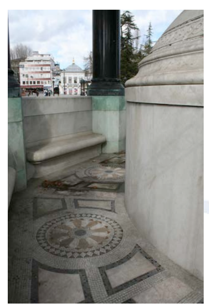
Figure 5: The Corridor

Inside the structure, there are marble banks between the water reservoir and the column row. This is a unique arrangement. (Figure 5) Especially in this fountain, which considering the placement of the faucets, clearly supposed to be experienced from outside. This unique aspect of German Fountain's design can be one of the discussion points in determining if the baldachin plan used in the German monuments in the turn of the century was adapted to this Fountain, somewhat forcefully.