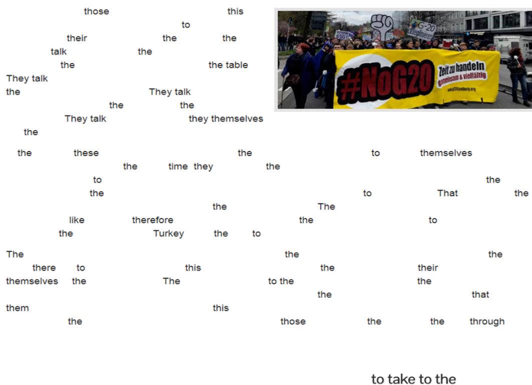
Figure 4: A screenshot of "The Deletionist" applied over the Anti-G20 website ("Coalition Call to Action"). Retrieved from http://g20-demo.de/en/call/ . ©2013 Deletionist & ©2019 G20 Demo. Screenshot by author.

The following lines are harder to decode than other lines. Never has an Ad by one means or by another cast away every restraint, spurn every one. An effective recommendation algorithm requires a thorough collection of users' data without any constraint. In the meanwhile, this act of data collection implies that this Ad disregards every user's rights to protect their own data. The last two lines prompt readers to ponder on the relationship between this Ad-poem and the recommendation algorithm. "This Ad is the secondary instrument of your own algorithm./This Ad flogs your digital ticker." The two lines can be understood in terms of an investment. A digital ticker can refer to a stock market ticker whereas a primary instrument can refer to "a financial investment whose price is based directly on its market value" ("Primary Instrument"). This Ad-poem, as the secondary instrument of a recommendation algorithm, disrupts the market value and sells the stock quickly and cheaply. Ultimately, this Ad-poem transforms a commercially-driven Ad into a thought-provoking piece of artwork. Readers are given time to conduct a critical reading to the webpage.