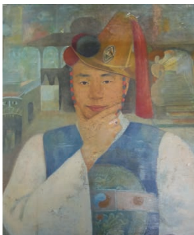
Figure 1: Shaman (Baksu) , 1930s, Oil on Canvas, 55×45cm. Ethnological Museum of Berlin.