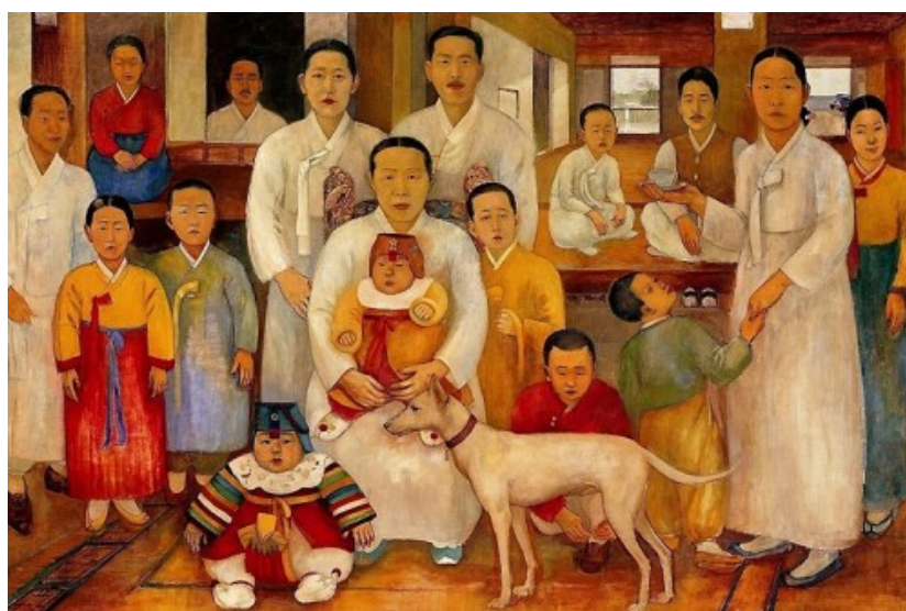
Figure 4: Portrait of Family , 1930–35, Oil on Canvas, 140×200cm, Private Collection.