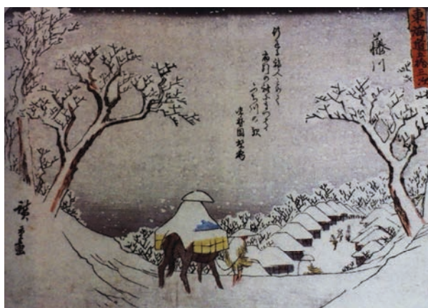
Figure 3: Utagawa Hiroshige, Ishiyakushi , The 53 Stations of the Tōkaidō Road Series, 1841–42, 8.5×13cm, Published by Yamada-ya Shojiro.

genre. 3 For example, the similarity of composition between his On the Way Home and Pieter Bruegel's genre paintings are often pointed out (Migeum, 2003, p. 81). However, I would like to propose another point. For me, the subject matter and composition of On the Way Home is very similar to those of Ishiyakushi from the 53 Stations of the Tōkaidō Road Series by Hiroshige Utagawa (*3). It would not have been too difficult for Un-soung Pai to gain access to Ukiyo-e in Germany at that time, because from the beginning in the 1910s, great interest in Ukiyo-e was accelerated by publications by Julius Kurth (1922a, 1922b, 1923) in Germany. 4 It is believed that Pai studied Ukiyo-e as a form of training, and his affection for the genre is evident in his art.