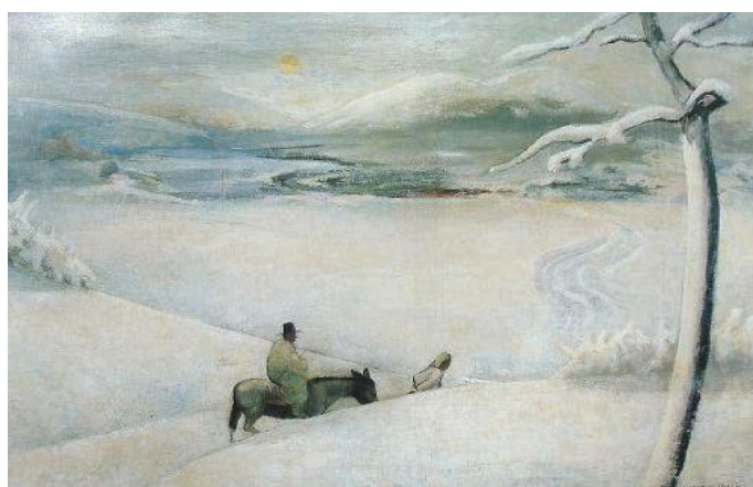
Figure 2: On the Way Home , 1938, Oil on Canvas, 110×160cm.

“Oriental lines and Western colors (東線西色)” is the expression that best describes the characteristics and features of Un-sung Pai's paintings. His paintings were recognized and accepted by Europeans as Oriental artworks painted according to Western techniques. Regarding Pai's solo exhibition in Hamburg in 1935, a German critic has pointed out that Pai's color choices and shadow expressions were somewhat underdeveloped. On the other hand, he evaluated Pai's Children of Korea highly, praising the attractiveness of the flat composition and the beauty of the line drawings (MRK, 1935, cited in Migeum, 2003). We can understand what Europeans looked for in paintings by Un-sung Pai from this critique. Pai also believed that maintaining the “Oriental classic” style was essential for mastering Western painting techniques. For him, line drawing was the most effective way to express this style. He often drew lines using calligraphy brushes on canvas. Pai transmitted the flavor of Asia through his paintings. His work titled On the Way Home (*2) is an example of that. This beautiful oil painting, entered into the National Society of Fine Arts (Société Nationale des Beaux-Arts) in France in 1938, is full of lyrical emotion and the Oriental sense of beauty.