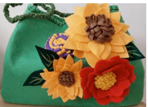
Figures 4 (b): Baggit Handbag

Figure 4 (b) – Student: SOMAIYA HUMAID SALIM AL HAKMANI