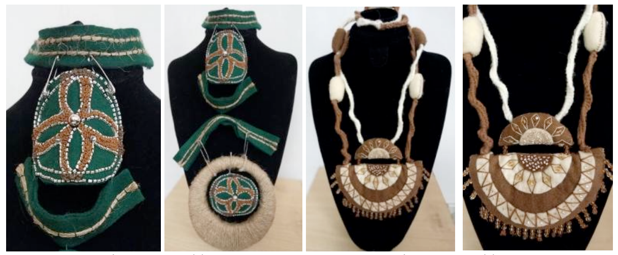
Figure 8: Necklace