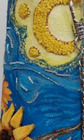
Figure 3: Water Cover' Bottle

Figure 2 – Student: NOOR AL HUDA MOHAMMED SAID AL ANBURI