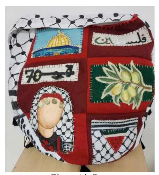
Figure 10: Bag

Techniques: Padding- embroidery- synthetic fibers-crochet