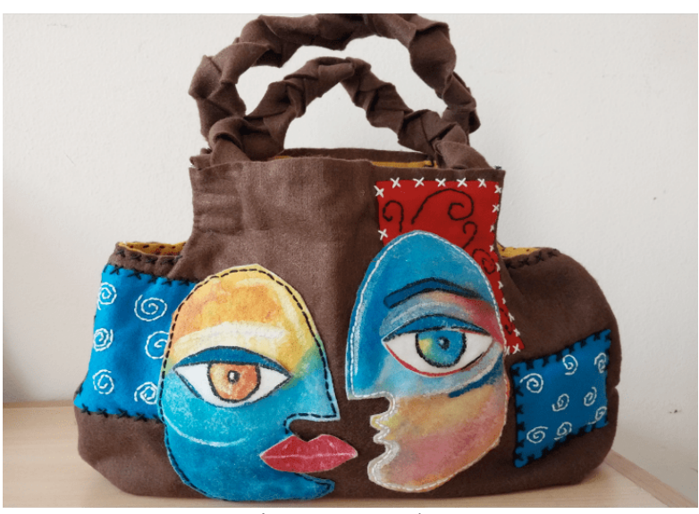
Figure 1: Bow bag

Figure 1 – Student: ABIR KHAMIS SAID AL RUZEIQI