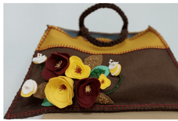
Figure 4 (a): Baggit Handbag