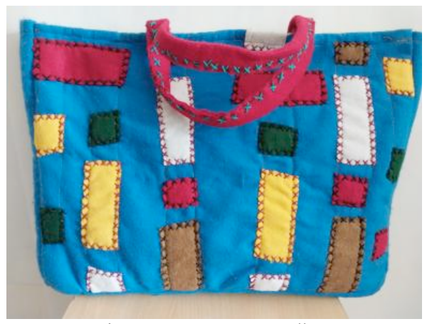
Figure 5: Laptop Handbag

Figure 5 – Student: AHMED SAID MOHAMMED AL KHATRI