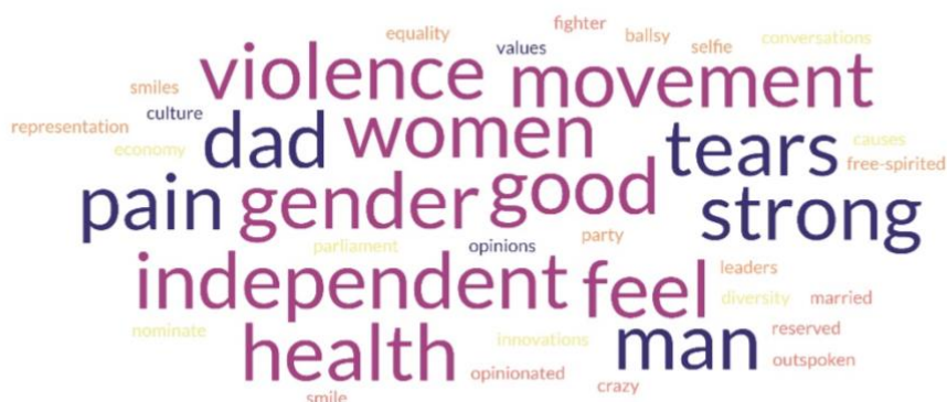
Fig. 2: Word cloud of SDG Gender equality (English language ad)

For practical purposes, we have two major addressed SDG theme of advertisements; Good health and wellbeing (26.2%) and Gender equality (19%). We have observed linguistic nuances in words and terminologies used in social advertisements. For example, Fig. 2 shows Gender equality (English) concentrates on nuanced societal issues, encompassing violence, movement, and challenges faced by gender, reflecting themes of strength and independence. In contrast, Gender equality (Hindi) addresses broader facets of daily life, job, family, body characteristics, and events in one’s life as shown in Fig. 3.