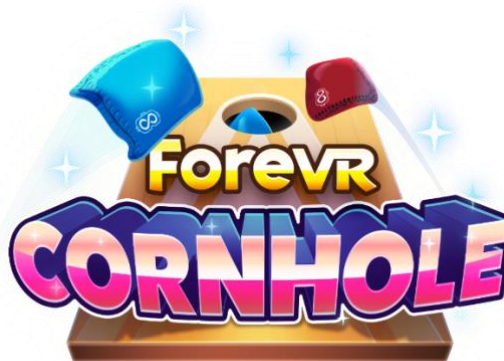
Figure 2: ForeVR Cornhole.