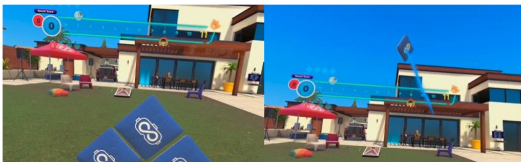
Figure 4: Elderly people playing a nostalgic VR beanbag game.