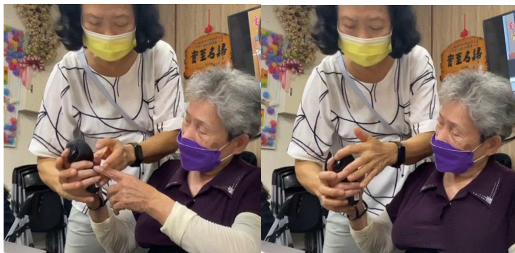
Figure 5: Actively teaching other elderly how to use controllers.