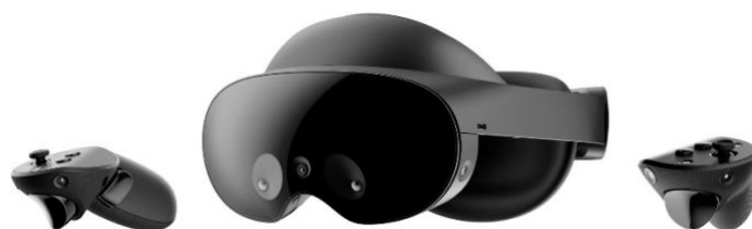
Figure 1: Meta Quest Pro VR.

In this research using Meta Quest Pro VR for experimental tools (Figure 1) and ForeVR Cornhole for experimental games (Figure 2).