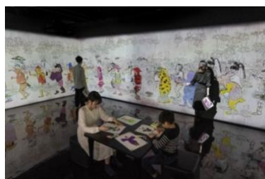
Figure 3. TeamLab Walk, Walk, Walk Home

Produced by TeamLab International Art Group, the artwork shows people's journey home through projection technology, giving the audience a sense of time travel, blending projection technology with the understanding of walking and going home, presenting a unique artistic style and reflecting the trend of fusion between technology and art.