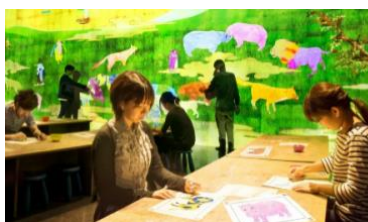
Figure 1. TeamLab resonance microchamber - curing light color, dusk to dawn.

TeamLab is a multidisciplinary international art organization founded in 2001 and headquartered in Tokyo, Japan. Their team consists of artists, programmers, engineers, CG animators, mathematicians and architects, and they call themselves “super technologists”. The team's animal-themed paper sculptures display life-like animal shapes, with the silhouettes and features of the animals hand-drawn onto the paper to create unique and vibrant artworks.