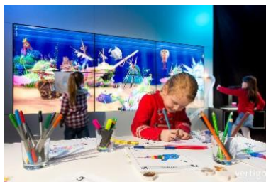
Figure 2. Vertigo Systems living ocean