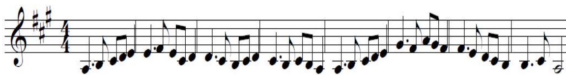
Figure 6: The variation 4 of the music composition “Transform”