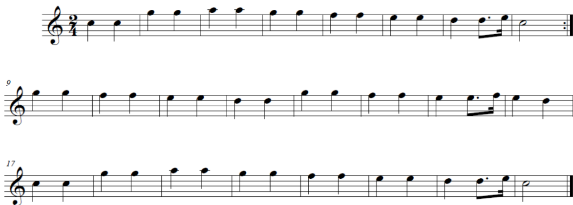
Figure 1: The theme of the music composition "Ah, Vous dirai-je, maman"

Mozart's piano composition on "Ah, Vous dirai-je, maman" has a theme and 12 variations (Figure 1). The music piece "Ah, Vous dirai-je, maman" uses melodic variations, rhythmic variations, harmonic variations, and tonality variations. Melodic variations use decorates and inharmonic tones in the first variation; rhythmic variations change the duration to syncopated off-beats in the fifth variation; harmonic variations use the circle of fifths in the seventh variation; and tonality variations change the major mode to the parallel minor mode in the eighth variation. Through the analytic results of variation techniques, an innovative variation music piece named "Transform" is to be composed.