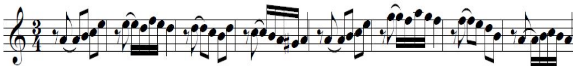
Figure 4: The variation 2 of the music composition “Transform”