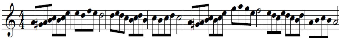
Figure 3: The variation 1 of the music composition “Transform”