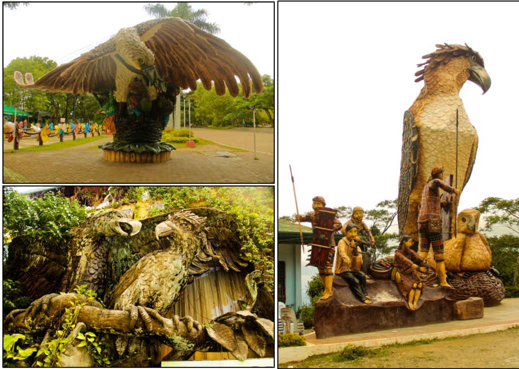
Figure 5: Fortinez, J.E. (2014). Philippine Eagles , Davao City [photograph]. Eagle sculpture at People's Park (upper left), eagle sculpture at Ponce Suites (lower left), and the King of the Philippine Skies welcome landmark (right).

The concepts of nationalism and national identity are constructed by post-colonial politics to create an “imagined” environment that fulfills in unifying an otherwise diverse people who has collectively experienced colonialism. The concepts of nationalism and national identity are also complex because it is impossible for the entire Filipino population to know each other. Although the concept of a nation is vague and theoretical, its existence is something that the Filipino people take for granted because it refers to a particular type of memory that is inculcated upon us at an early age. The people are obligated to have this sense of nationalism because the people are all a part of the state (David, 2002, p.3). Filipino professor of Sociology, Randolph S. David (2002) states that “history is seen as a tool with which to write and rewrite a memory for a people who are constantly reflecting on the ways to achieve nationhood” (p.5). With symbolic forms of nationalism, which in retrospection will deduce as not uniquely exclusive to a specific place, it is no wonder that some historians and theorists view the Filipino nation as an “imagined” community.