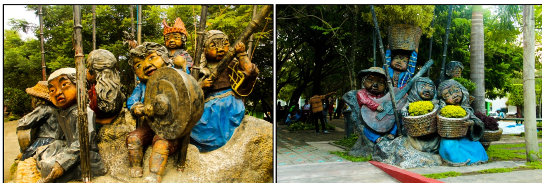
Figure 2: Fortinez, J.E. (2013). Indigenous people sculptures , Davao City [photograph].

In the case of Kublai Millan, he used narratives of historical and cultural experiences specific to Davao City and its diverse peoples and cultures to convey knowledge and entertainment. The sculptures around Davao City are easily identifiable as Kublai Millan’s via the consistent usage of massive scale, his sense of sculptural aesthetics, in some cases exhibiting unusual proportions through large heads with small cherub-like bodies, and are painted colorfully. Most of the sculptures exhibit huge grins with exaggerated and animated features; wear tribal and traditional costumes; and show everyday activities like farming, gathering food, playing musical instruments, dancing, amongst others (see Figure 2). These depictions are stripped of the human frailty and harsh realities of everyday living, of hardships and squalid existence, resembling a sanitized and almost perfect depiction of life, hence, Disneyized 3 and not ultimately a good form for factual knowledge.