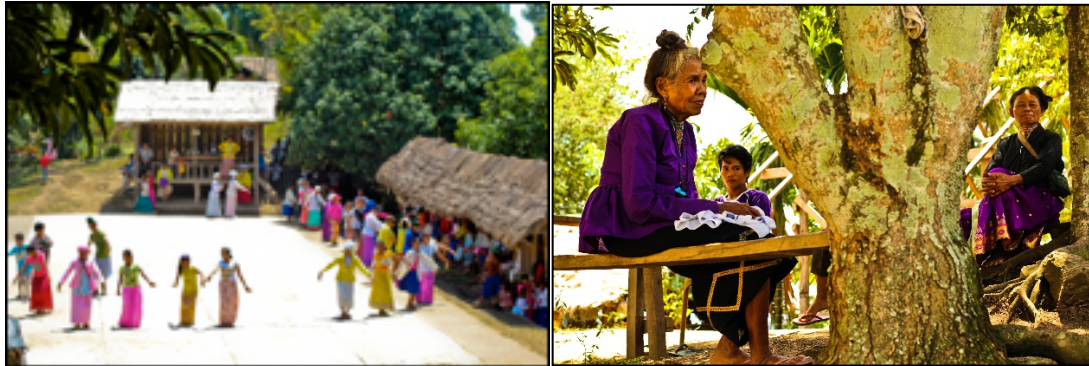
Figure 3: Fortinez, J.E. (2014). Remembering , Cotabato [photograph].

“the town becomes the destination and its local heritage, the resource” (p.14). This becomes the case for Davao City’s manufactured and themed environment. The public spaces become the destination and Kublai Millan’s gigantic sculptures which are embedded in the landscape become the resource.