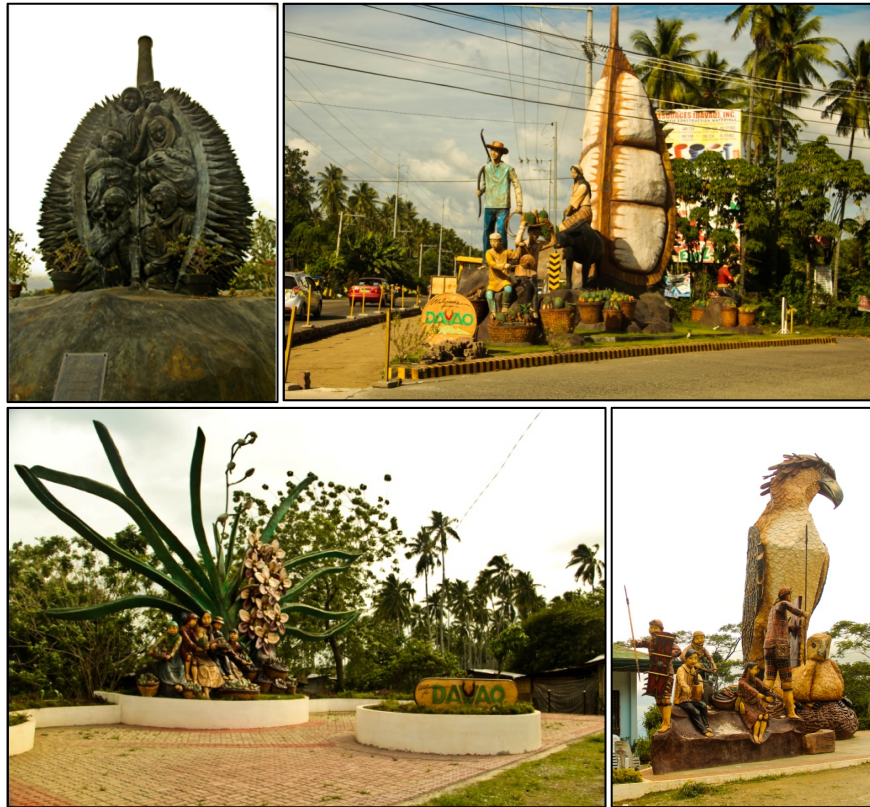
Figure 4: Fortinez, J.E. (2014). The welcome landmarks, Davao City [photograph].

Hybrid consumption. The second central element, hybrid consumption, is a type of consumption that cannot be categorized in a traditional marketing setting which involves a consumer who buys both “cheap generics and low-end brands” and “premium, high-end brands” in diverse occasions (Leppänen & Grönroos, 2009, p.1). The goal of hybrid consumption is to get the people to stay longer in the manufactured environment to maximize opportunities through spending and shopping (Bryman, p.58). There are no commercial establishments and food, novelty items or souvenir vendors inside the People’s Park, one of the case studies, which means hybrid consumption is not totally present. Furthermore, vendors are located outside the gates and independent from the park management, and instead the park goers bring their own food. However, if one limits hybrid consumption to its premise of prolonging the enjoyment of the park, then hybrid consumption is in effect because Davao’s public spaces, specifically People’s Park is a haven at the heart of the city where one can relax.