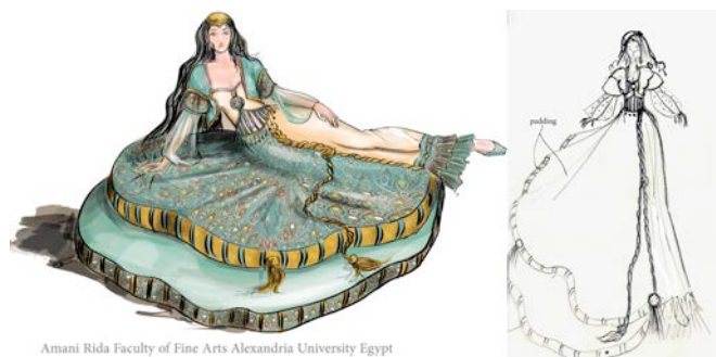
Amani Rida Faculty of Fine Arts Alexandria University Egypt

Other costume designs are only revealed and realized after a certain movement which transforms the costume into other scene elements such as a large cushion or a fountain. The actress (character) steps onto the stage wearing a dress, performs in front of the audience and in the moment she wants to lay down on a large cushion, she just lies with her dress on the floor. The relation between the actress and the dress is now altered. It is not a dress any more, but the lower part is transformed into a cushion on which the actress is laying. (Figure 5) The illusion here depends on the design of the dress, and the padded lower part, the posture of the actress and of course the imagination of the audiences.