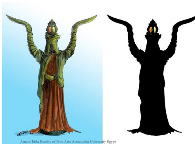
Figure 3: Human silhouette showing imaginative architectural details. (Rida, 2014)

Those are now performing along with other actors on stage. Through my suggested designs, we notice that the actor is sometimes completely hidden and other times visible. Some parts of his body could be revealed, such as his face or arms, or even his shape through the known human silhouette. (Figure 3)