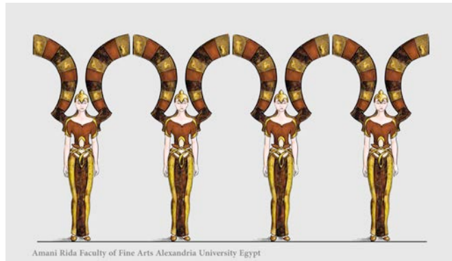
Figure 7: Wings shaped arches of the kings foyer from Tawfeek Elhakeem's "Sheherezad". Sheherayar is imprisoned in the place and wants to liberate himself. (Rida, 2014)

According to the Dictionary of Contemporary English for Advanced Learners, conceptual means dealing with ideas, or based on them. Consequently the same dictionary defines conceptual art as technical art in which the main aim of the artist is to show an idea, rather than to represent actual things or people. Scenery costumes are conceptual, too. They interpret aspects in the events such as, "libration" (Figure 7) and "the state of being in a vicious circle" (Figure 8).