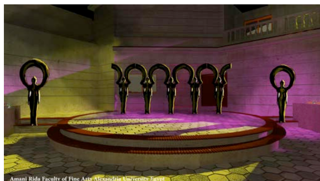
Figure 8: Closed arches of the kings foyer from Tawfeek Elhakeem's "Sheherezad". Sheherayar is imprisoned in a vicious circle. (Rida, 2014)