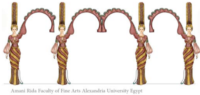
Figure 1: Arches and columns showing details of historical style. (Rida, 2014)

The environment and its elements on stage, rigid and solid scenery (2D and 3d elements) are transformed into live performers/objects. These can be arches, columns, fountains, couches, cushions, rivers, etc. . (Figure 1,2)