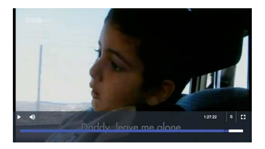
Figure 6: Gibreel says 'leave me alone' in Five Broken Cameras

The film has attempted to document the lengthy resistance in Bil'in, and operates as a non-violent protest itself, thus raising attention and concerns. Another distinct achievement is how Five Broken Cameras has successfully altered the prejudice to Palestinians, to an extent. From the perspective of a local resident, the people are presented as normal beings, rather than terrorists or querulous victims. They are a people who have the ability to make something positive out of the catastrophe: through courage, love, intimacy, optimism and imperishable hope. On the whole, Five Broken Cameras lays bare the realities of the occupation, and more significantly, challenges the stereotype of a 'violent Palestinian', asserting the visibility and the humanity of the nation (Gils & Shwaikh, 2016, p. 451).