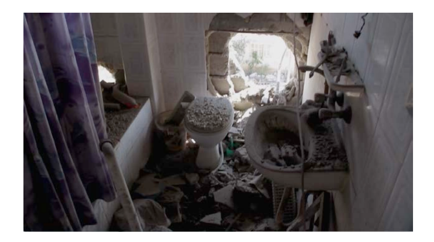
Figure 11: Houses are destroyed in Ambulance

On the whole, Ambulance exposes the hidden atrocity in Palestinian to the outside world, from a local citizen's perspective. It offers a viewing experience on the run, during which the audience rushes to all directions together with the ambulance crew, directly faced with blood, dead bodies, ruins, explosions, and trapped in endless chaos and oppression, just like the Palestinians. The intersectional combination of both visual arts and journalism has turned out to be a powerful non-violent protest, voiced by first-person narration and ranges of testimonies, and voicing accusations of the ruthlessness of Zionism.