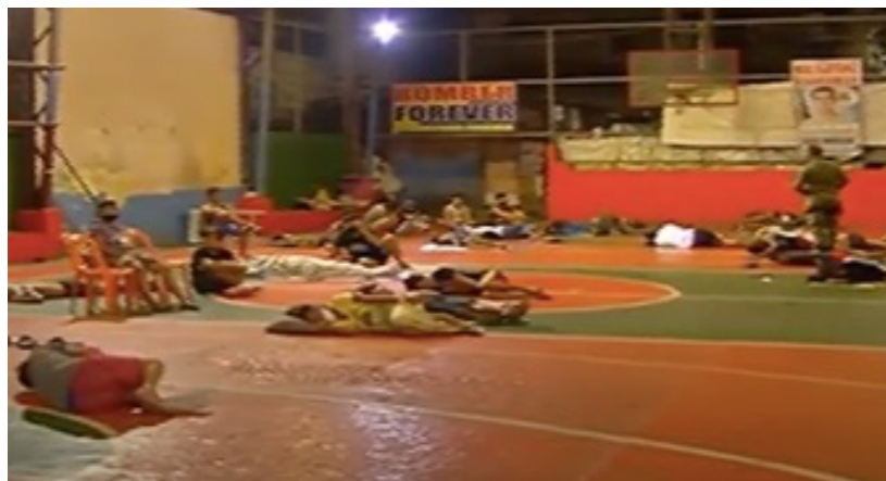
Figures 13 and 14. Community basketball courts were turned into holding areas for residents who were caught violating quarantine rules [top]. Some of the violators were ordered by the police to make push ups as a form of punishment [bottom].

The village court is an equally valuable asset to the COVID-19 campaign as a haggling spot for mobile palengke (market), testing sites, as well as holding facility for locally stranded individuals (LSI) and quarantine violators, who were caught breaking curfew and stay-at-home regulations. Most LSIs who work in Metro Manila were barred from returning to their homes in the provinces after the lockdown was implemented (Punsalang, 2020). Some of them spent almost a day on the village court