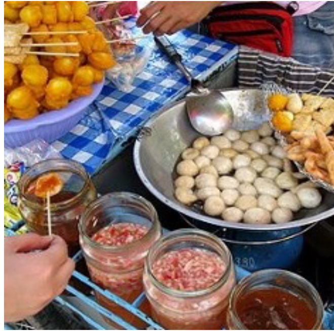
Figure 4. Street food is popular among patrons of the barangay liga [village league]. Make-shift stalls are usually installed just beside the community court where the barangay liga is held.