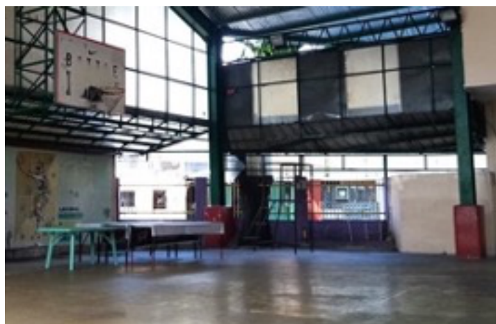
Figures 8 and 9.. Lockdowns to address the pandemic had greatly affected local basketball life. These playing courts in Tondo, Manila [top] and Quezon City [bottom] remained empty since strict quarantine measure were implemented last March.