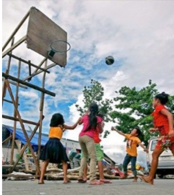
Figure 2. Basketball courts can be found almost anywhere in the Philippines. This wooden court with children randomly playing is a common sight in the Philippine countryside.

among people from different backgrounds, serving as a mode of collective self-expression and standing as symbols of a common identity (Antolihao, 2015, 66). The sport was part of the assimilationist blueprint of the US insular government in the Philippines. Soon after, it forged a nationalist bond with the people as Filipinos made waves in the pre-war Far Eastern Games and the Olympics.