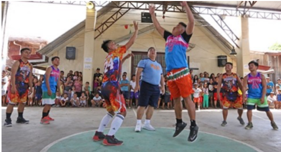
Figure 3. The barangay liga (village league) is a traditional crowd drawer in local communities, especially during the summer period. It's a tournament where almost every member of the community can participate, regardless of age and social status. In this photo, national police chief Debold Sinas [center] made the ceremonial toss to start the game.

(to cook) which alludes to biased officiating. All these are common lore and language in every community basketball court around the Philippine archipelago, especially during the months of the highly anticipated ligang barangay (village league).