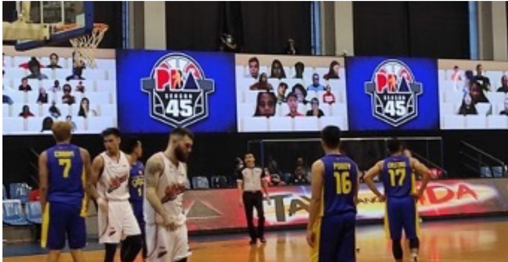
Figure 15. An image of a game inside the PBA bubble in Clark, Pampanga. The PBA bubble was deemed the first step to reclaim normalcy in the country's basketball situation amid the ongoing pandemic.