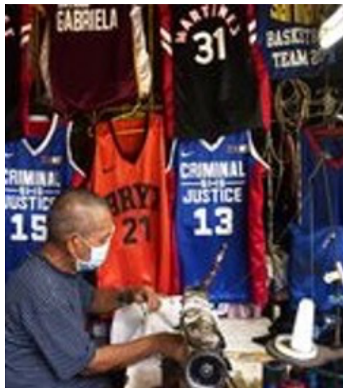
Figure 7. Jersey shops were forced to look into other means like face mask production with cheaper returns after the lockdown effectively suspended all community basketball leagues in the country during the summer.

Philippine basketball's other working individuals like the beloved neighborhood tailor who used to earn P5,000 to P15,000 ($100 to $300) from completing a 12-piece set of basketball uniforms for every liga team, had to set aside his jersey-making business to produce the more in-demand cloth masks for P30 ($0.60) a piece. Even the sport's much maligned official – the referee – is frowning the absence of the liga . Simply put: No liga . No games. No income. A referee can earn at least P2,000 to P5,000 ($40 to $100) for officiating a barangay liga . Meanwhile, professional referees in the PBA receive a basic monthly salary of P20,000 to P40,000 ($400 to $800) depending on which class they belong to (Badua, 2015). But now, no one's whistling, even if COVID-19 has committed the most brazen flagrant foul to their families' day-to-day survival.