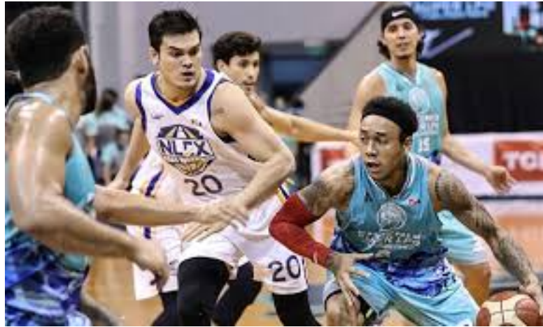
Figure 16. Calvin Abueva's return to the PBA from an indefinite suspension was welcome news to many Filipino basketball fans. During his suspension, Abueva spent most of his time helping frontliners and others affected by the months-long lockdown due to the pandemic.