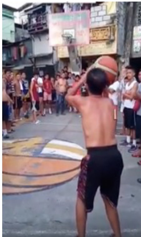
Figure 5. Pick-up games and shoot-outs are common among street folks who literally earn a living playing basketball. But the pandemic has kept them away from the court for months now.

The basketball court transforms into a virtual tourist attraction once the ligang barangay (village league) tips off in late March or early April. From its sidelines, street peddlers converge to convene one of Philippine sports' enduring informal economies. Snacks – from street food staples like fried banana, camote (sweet potato),