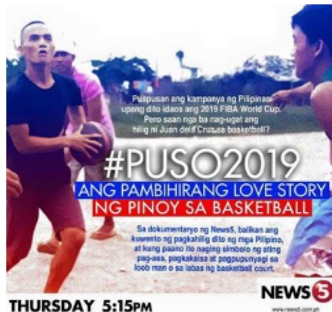
Figure 1. A poster card of a 2015 documentary explaining the Philippines' mad love for basketball at the height of the country's bid to host the 2019 FIBA World Cup.

Games and practices were abruptly called off after President Rodrigo Duterte placed Metro Manila, and later the entire Luzon island under Enhanced Community Quarantine (ECQ) to stem the impending onslaught of COVID-19 in the Philippines. The lockdown hobbled the economy, and with it, a slice of Philippine life as reflected in the sport of basketball.