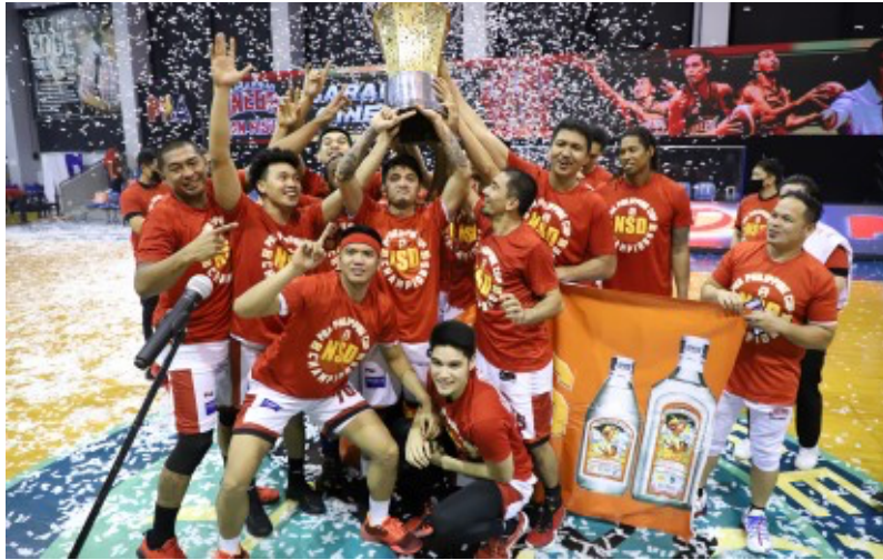
Figure 17. The Barangay Ginebra Kings celebrate after winning the Philippine Cup in the PBA bubble. Ginebra, the most popular basketball team in the Philippines, is the first PBA team to win a title in a bubble set-up. The team dedicated its victory to the Filipino people and pledged to support the country's efforts against the COVID-19 pandemic.

The country's move to mount a semblance of basketball normalcy also took off with participation in the second window of the 2021 FIBA Asia Cup qualifiers in Manama, Bahrain, despite initial opposition, citing the possibility of exposing players to the virus while traveling abroad. The national basketball team composed of college standouts spent two weeks in a bubble-type training facility to quarantine and prepare for the qualifiers, where they eventually swept Thailand to remain unbeaten in their group. Some games in the third window of the qualifiers will be played in the Philippines using the PBA bubble set-up in Clark, Pampanga.