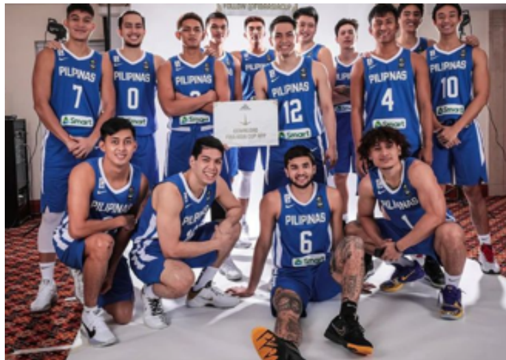
Figure 18. Gilas Pilipinas, bannered by college standouts, swept all its games in the Bahrain bubble of the FIBA Asia Cup 2021 qualifiers. The national team's participation was part of initiatives to slowly restore basketball normalcy in the country amid the pandemic.

The country's move to mount a semblance of basketball normalcy also took off with participation in the second window of the 2021 FIBA Asia Cup qualifiers in Manama, Bahrain, despite initial opposition, citing the possibility of exposing players to the virus while traveling abroad. The national basketball team composed of college standouts spent two weeks in a bubble-type training facility to quarantine and prepare for the qualifiers, where they eventually swept Thailand to remain unbeaten in their group. Some games in the third window of the qualifiers will be played in the Philippines using the PBA bubble set-up in Clark, Pampanga.