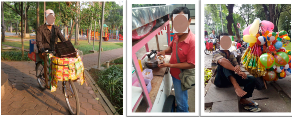
Figure 8 Among the vendors interviewed in case study park parks during fieldwork March- April 2016