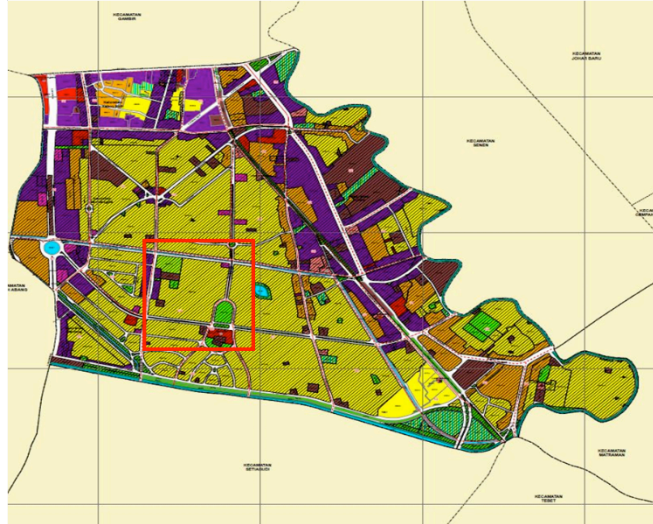
Figure 1 Map of the administrative village of Menteng with the location of case study parks (Taman Suropati and Taman Menteng) in highlighted within red boundaries.

Former Burgemeester Bisschopplein or Taman Suropati is located across what is currently the administration office of the Vice President of Indonesia, sits as also opposite of the official residence of the Ambassador of the United States.