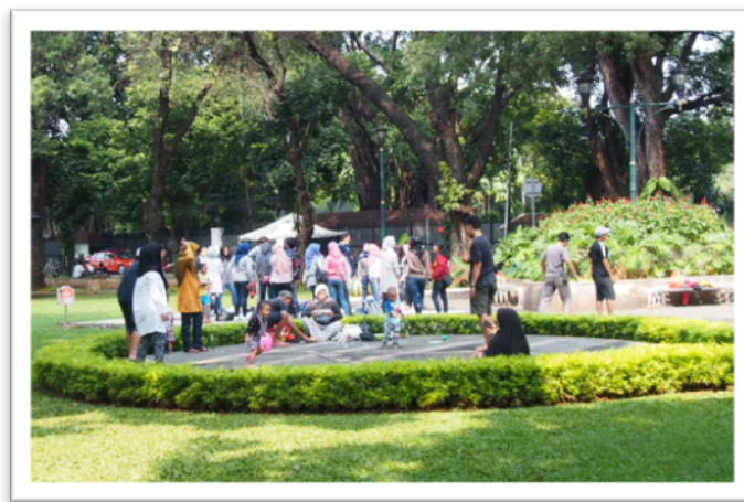
Figure 9 Suropati park users participating community activities on a Sunday afternoon