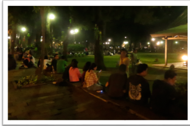
Figure 7 Image is showing park users of Suropati on a Saturday night. Visitors are seen enjoying public space with family, friends and loved one despite not having seating arrangements provided.