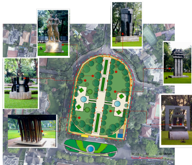
Figure 6 Taman Suropati Map of symbolic art features

To preserve the peace and comfort of the many diverse populations Jakarta residents, the modifications and upgrade to Taman Suropati appears to be in the form of symbolic arts and cultural activities that the park offers. The walking path from south to the north of the park allows a view of six prominent artworks; three on the left and three on the right with each representing the symbolic friendship and diplomatic ties between Indonesia and its Southeast Asian Nations (ASEAN) countries. These six pieces include the “Peace-Harmony and One” by Lee Kian Seng (Malaysia), “The Spirit of ASEAN” by Wee Beng Chong (Singapore), “Fraternity” by Nonthivathn Chandhanaphalin (Thailand), “Harmony” by Awang Hj Latif (Brunei), “Rebirth” by Luis E. Yee Jr. (Philippines) and “Peace” by Sunaryo (Indonesia). Each artwork lights up as shown in Figure 7.