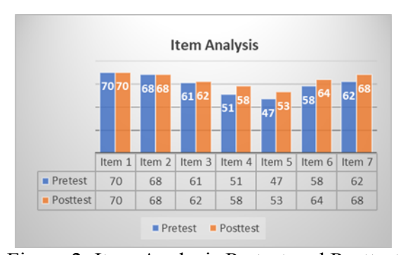
Figure 2: Item Analysis Pretest and Posttest

For figure 2, the result shows that the students' pretest results were high, this means that they have prior knowledge of the concept questions asked.