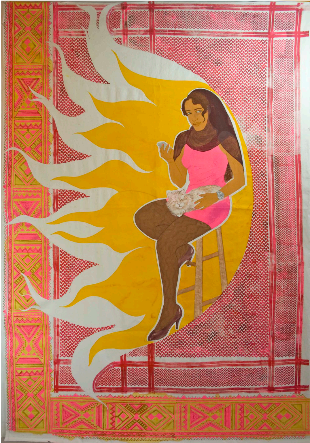
Figure 5 Hend al-Mansour, Habiba in Pink , 2013.