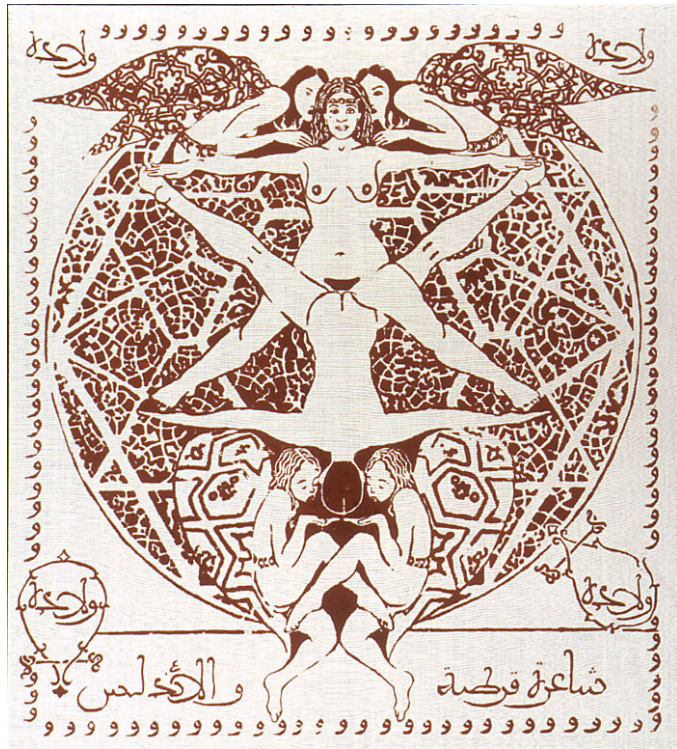
Figure 6 Hend al-Mansour, Wallada , 2004.