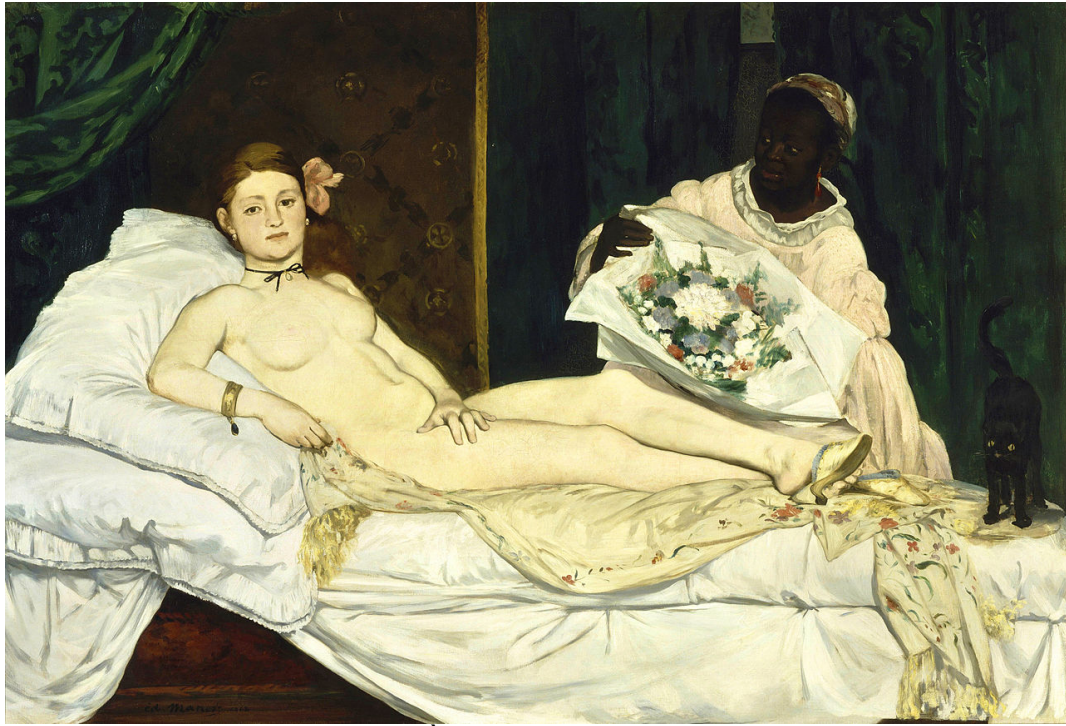
Figure 11 Édouard Manet, Olympia , 1863