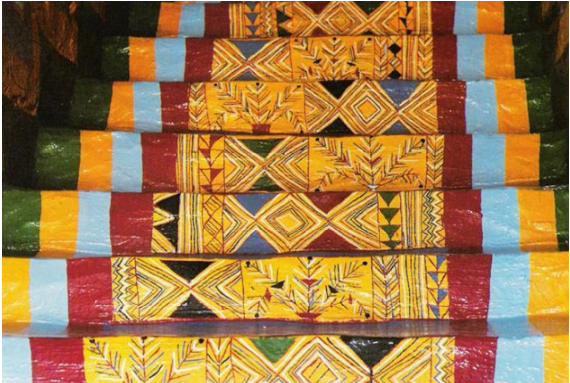
Figure 8 Unknown artist, Bedouin interior Fresco designs from Asir region, Saudi