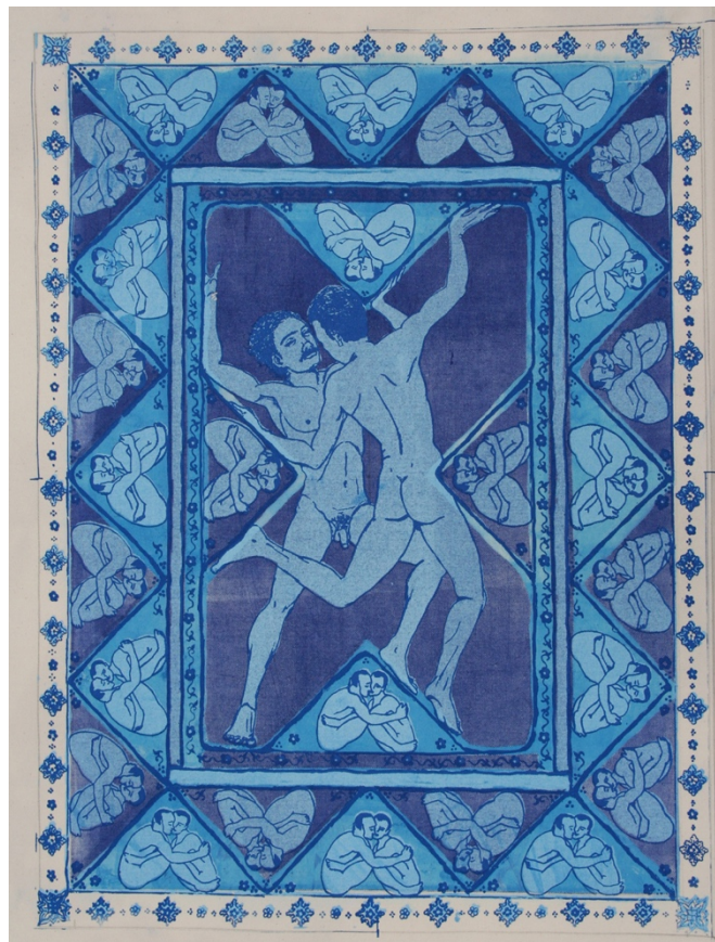
Figure 7 Hend al-Mansour, Dark Lovers , 2008.