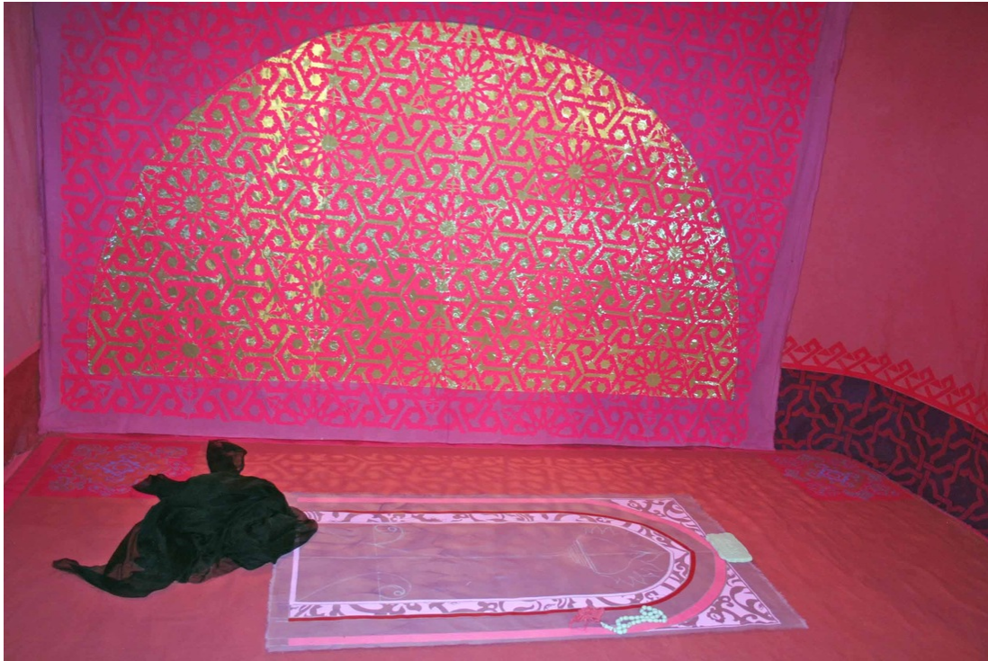
Figure 3 Hend al-Mansour, Habiba's Chamber Installation (inside view #2), 2013.