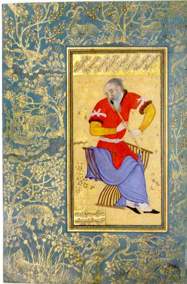
Figure 10 Persian Miniature Painting, The Kevorkian Portrait of a Seated Flautist , c. 157