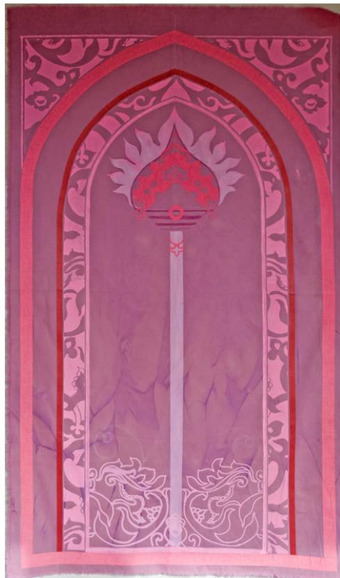
Figure 4 Hend al-Mansour, Habiba's Chamber Installation (inside view #3/ prayer rug), 2013.