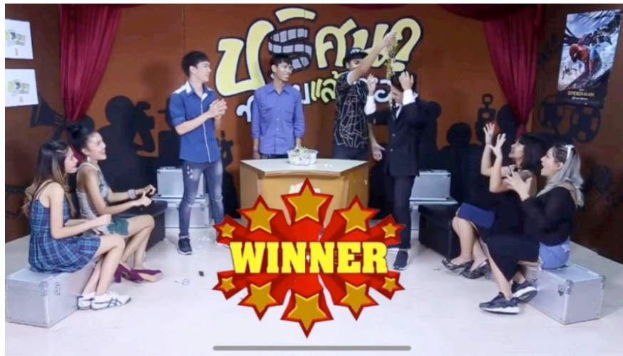
Figure 1: Answer If You Can (Pritsana Sab Laew Tob)

The program entitled "Answer If You Can" (Pritsana Sab Laew Tob) is a 15-minute quiz show about Thai and international films. There were 2 teams; each team consisted of 3 members. The 2 teams had to compete with each other by answering questions about Thai and international films correctly. The game was divided into 2 rounds; the team collecting the highest point would become the winner.