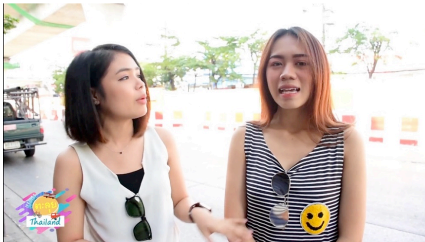
Figure 3: Around Thailand (Ta Lui Thailand)

The program entitled “Around Thailand” (Ta Lui Thailand) was a 15-minute travel series aiming for taking the audiences to important and attractive tourist destinations in Bangkok hosted by 2 female buddies.