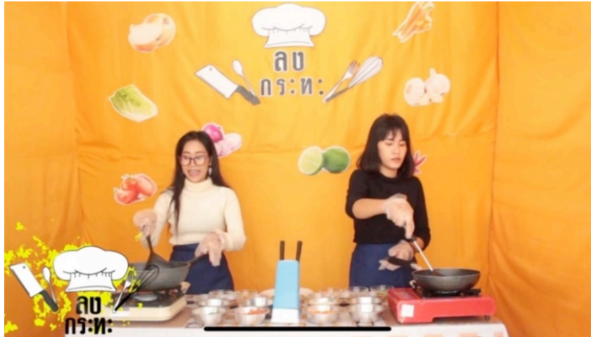
Figure 2: On the Wok (Long Kra Ta)

The program entitled “Around Thailand” (Ta Lui Thailand) was a 15-minute travel series aiming for taking the audiences to important and attractive tourist destinations in Bangkok hosted by 2 female buddies.