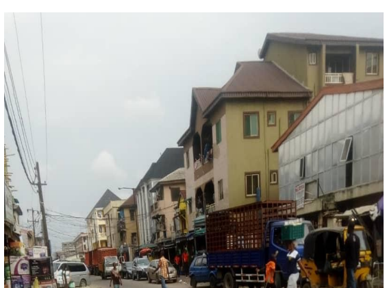
Typical Street Layout in Ebute Metta