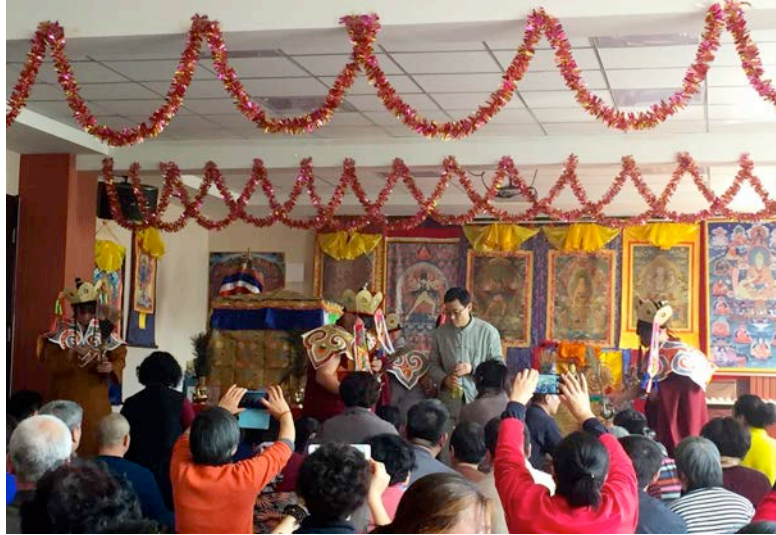
Figure 1 The Kalachakra initiation

In Tibetan Buddhism, initiation or empowerment means giving permission, in other words to grant the disciples the right to practice the Tantra, it also means planting seeds and nurturing to cultivate to attain certain capacity and to grow the Buddha fruits. Kalachakra mandalas are regarded as the actual divine abode of a particular Kalachakra Buddha state. There are six hundred and thirty-six Buddhas in this mandala. At the second day of the initiation, after a series of complex rituals for preparing to enter the mandala in meditation, all the disciples were guided enter into the Kalachakra mandala by the guru. The disciples imagine they enter the mandala under the guru's instruction and see all the Buddhas inside. According to the guru,