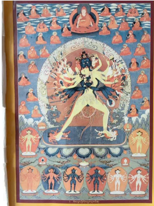
Figure 2 Four faced Kalachakra and consort

Figure 2 is an image of four faced Kalachakra (image is taken from internal teaching material among the group of Tibetan Buddhists). The four faces are black/blackish blue face in the centre, red face to his right, white face to his left, and yellow face at the back. The four coloured faces represent four constituents. In the centre, black/blackish blue represents wind, in other words, vital energy; red represents fire; yellow represents earth; white represents water. The four constituents in external wheel of time represent the four seasons in a year. Spring, summer, autumn and winter correspond to earth, water, wind, and fire respectively. Kalachakra has 24 hands, which represent the 24 divisions of solar year, two legs represent two tropics, red leg represents the tropic of Cancer, and white leg represent the tropic of Capricorn. This is the corresponding law of Kalachakra between body and universe, in other words, the corresponding law between inner Kalachakra and external Kalachakra.