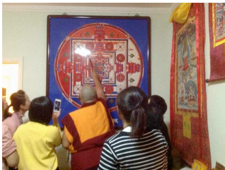
Figure 3 The guru explains the Kalachakra mandala to disciples

Figure 2 is an image of four faced Kalachakra (image is taken from internal teaching material among the group of Tibetan Buddhists). The four faces are black/blackish blue face in the centre, red face to his right, white face to his left, and yellow face at the back. The four coloured faces represent four constituents. In the centre, black/blackish blue represents wind, in other words, vital energy; red represents fire; yellow represents earth; white represents water. The four constituents in external wheel of time represent the four seasons in a year. Spring, summer, autumn and winter correspond to earth, water, wind, and fire respectively. Kalachakra has 24 hands, which represent the 24 divisions of solar year, two legs represent two tropics, red leg represents the tropic of Cancer, and white leg represent the tropic of Capricorn. This is the corresponding law of Kalachakra between body and universe, in other words, the corresponding law between inner Kalachakra and external Kalachakra.