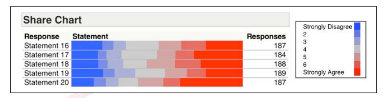
Figure 5: Intention to use social media

Table 8 represents the fifth construct – System accessibility.