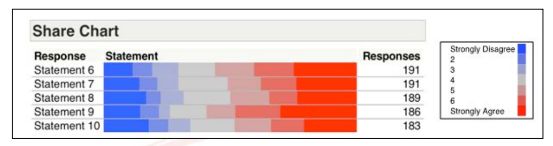
Figure 3: Perceived usefulness responses

The following share chart produces a visual representation of the responses with red agreeing and blue disagreeing.