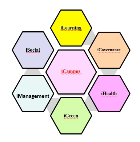
Figure 1: The 6 aspects of iCampus

6. iManagement: Various management, maintenance, surveillance and others in a centralized fashion.