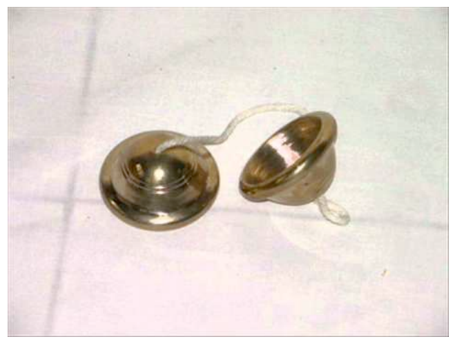
Figure 1 Ching https://www.youtube.com/watch?v=g5ADF6EIHG4