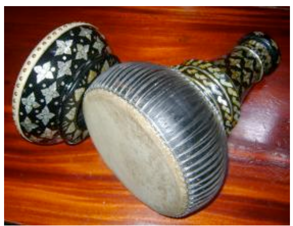
Figure 2 Klong (Ton Rummana) https://www.pantipmarket.com/mall/sapaya/?node=products&id=288291

There are a lot of special Technique of Thai Singing Style, for example "Auen". The sound for "Auen" are au, aui, aung,etc. that is a technique of pronunciation in Thai music. The melody of Thai song are difference in song form, so singing musicians must know the melody and understand in each song for singing style. More than that, the poem for singing are very difficult language, singing musicians must have clear punctuation so that it can be melodious and combination between Auan and melody. For singing clear and correct, Thai musician used note for learning and practice. Note for singing are very specific more than the other note of instruments.