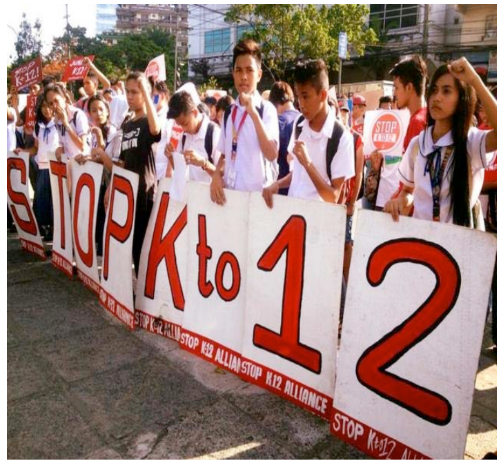
High school students protesting the adoption of K to 12 program: Their relatives call it another burden on the Filipinos.

There was also an observable increase in dropout rates compared to the students under K to 10. Two years into the program opposition Senator Antonio Trillanes IV warned that dropout rates will soar because of the additional expenses that come with two more years of high school. Estimates from opponents say that K to 12 added P20,000 for two years but the left-leaning Kabataan party placed the expenses could go over P100,000. (Geronimo, ibid.)