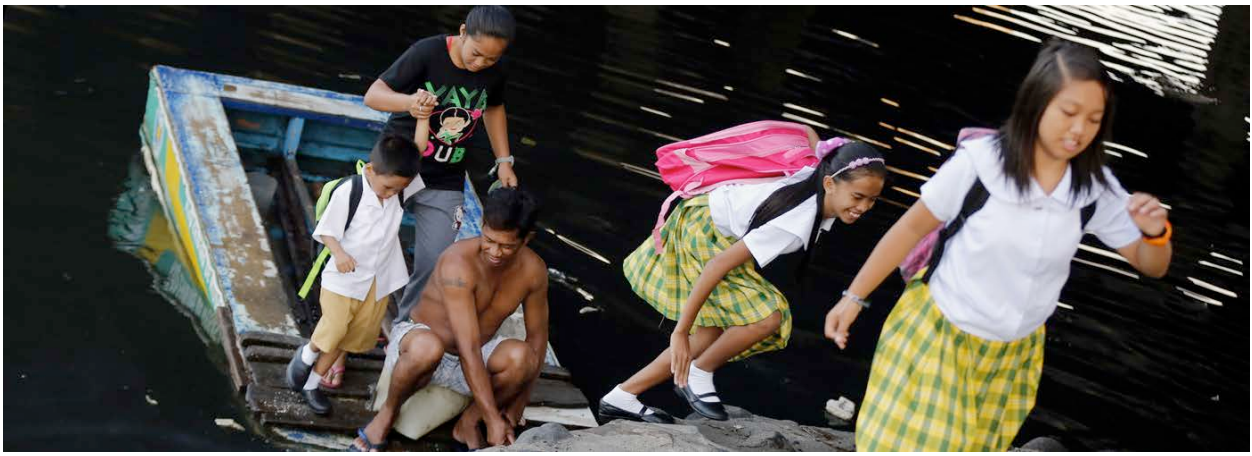
Students crossing a river on a makeshift raft to go to school

had to be bought. The costs are simply beyond the means of the ordinary Filipino student.