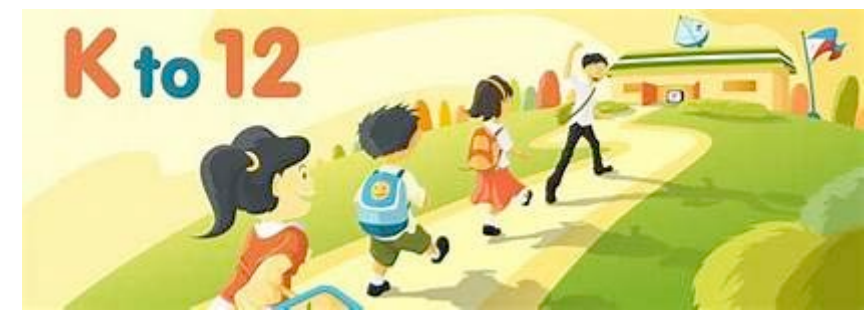
Image showing students being led to better education under K to 12

It was the decision then of the lawmakers to add the two years to basic education instead of adding two additional years in college so that more students will be included. It was based on the findings of the Education Committee that about 60% of high school graduates would elect to enter college. Thus the two additional years were added to the old high school which was renamed junior high school. It was envisioned that the graduate of the senior high school will be employable after finishing the two year curriculum.