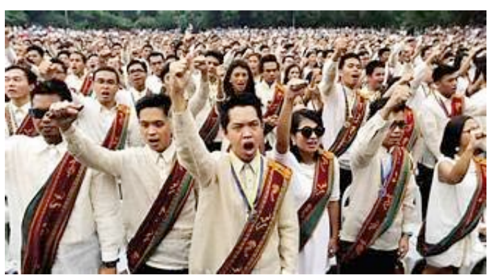
Graduates of the University of the Phlippines protesting educational reforms among other issues.

There was also an observable increase in dropout rates compared to the students under K to 10. Two years into the program opposition Senator Antonio Trillanes IV warned that dropout rates will soar because of the additional expenses that come with two more years of high school. Estimates from opponents say that K to 12 added P20,000 for two years but the left-leaning Kabataan party placed the expenses could go over P100,000. (Geronimo, ibid.)