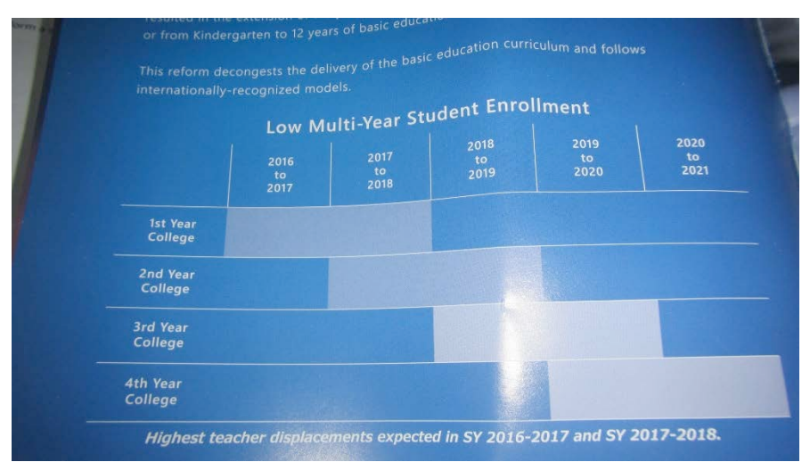
Projection by the Commission on Higer Education on the abnormal enrolment from 2013 to 2021. (Commission on Higher Education)