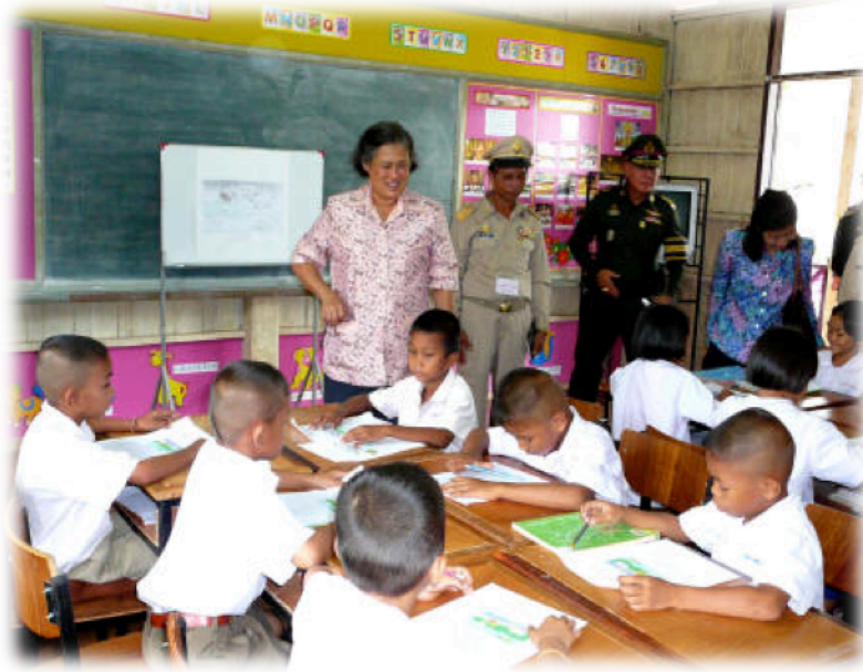
Picture 1 shows the actively in schools affiliated with Nakhon Nayok Primary Educational Service Area Office under the Royal Project.

2. In regard to the development of teaching skills based on Buddhist Instruction Model for teachers in schools affiliated with Nakhon Nayok Primary Educational Service under the Royal Project of her Royal Highness Princess Sirindhon, the experts rated that this instruction model was the most appropriate. The development of the model is illustrated in Picture 2 as follows.