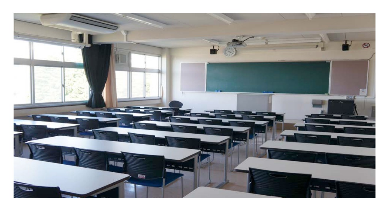
Figure 1. Arrangement of classroom equipment in the normal classroom