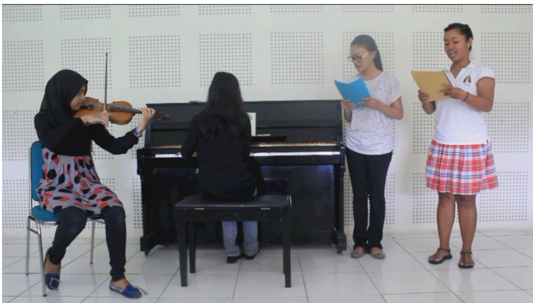
Figure 3: Students' Performance

Meeting 11-12: Upon completing the production of song-lyrics and musical compositions, and recording in DVD or CD format, furthermore, they presented the results of their song-lyrics project in front of the class at the end of the semester. The evaluation of working on the project was started from the first meeting when the students provided weekly reports of the project until the day when they presented a song accompanied by music instruments in front of the class.