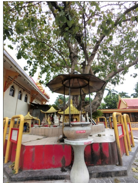
Figure 7: The worship Bodhi tree at Wat Chetawan.

As the research on the history of Buddhism, the Bodhi tree was symbolic of "awakeness" long before Prince Siddhartha Gautama entered the opening of enlightenment beneath its leaves in 528 B.C. Indeed, the name Bodhi or (also known as bo) means "awakening." Even the scientific world recognizes the spiritual associations with this tree as its botanical name, ficus religiosa , means "religious fig." The Bodhi tree is sacred in India and venerated in Bodhgaya where it is said the descendant of the original tree where the Buddha experienced spiritual awakening still grows.