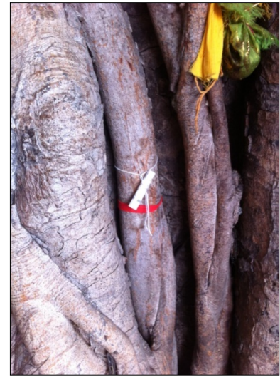
Figure 14: A wishing note of relationship wishes tied to the worship tree.

This summarized that in Hinduism; they worship the tree because it is a metaphor for their god named "Sri Nagaraja" and believe the tree is a comfortable shelter for "Sri Nagaraja" as a king of snakes. The believer makes a mark using yellow ribbon or red string or others ornament as a reminder message to "Sri Nagaraja" as to wish for safety and a better relationship in life.