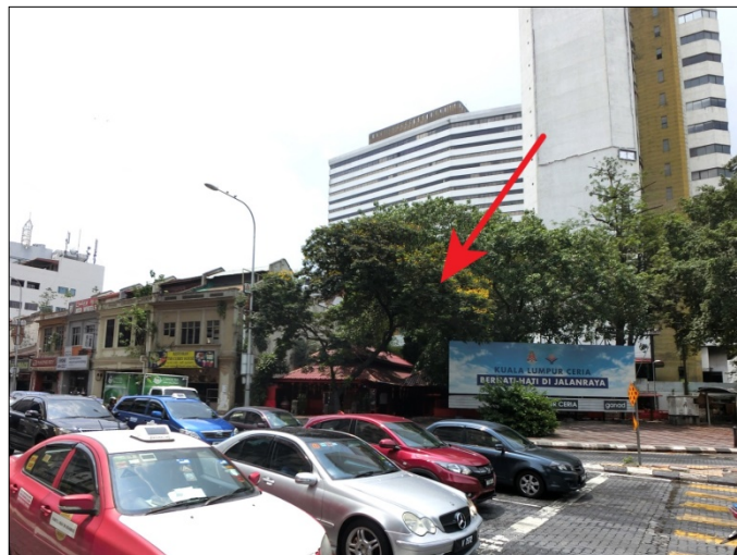
Figure 2: Overview of Ipoh Road Chinese Temple.

Sufism. Located in Ipoh Road, Kuala Lumpur. It is popular among Chinese society in Klang Valley. Its famous mythology incident has been spread verbally throughout the society in believing the temple. The location of the temple is located at the high traffic junction between Ipoh road and Tun Razak road, under the flyover bridge towards Putra World Trade Center (PWTC) in Kuala Lumpur (see Figure 2).