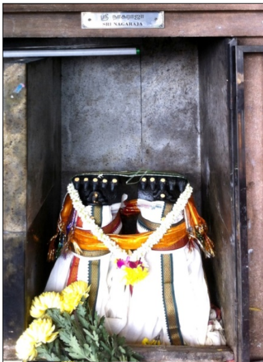
Figure 12: Statue of 'Sri Nagaraja'