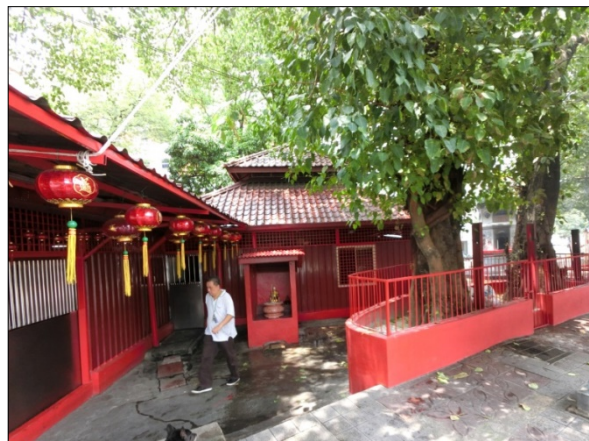
Figure 3: Ipoh Road Chinese Temple.

‘Datuk Keramat’ at this Chinese Temple gives a major influence to the society especially surroundings area of Ipoh Road based on its supremacy and mythology incident. Worshippers usually pray to ‘Datuk Keramat’ for protection, good health, good luck, and sometimes seek divine help to overcome their problems. As from time to time, the shrine and supremacy of ‘Datuk Keramat’ helped and fulfilled most of the society wishes and demand especially for wealth. As appreciation towards ‘Datuk Keramat’, the society has built a tiled cement hut as a comfortable shelter under the tree for “Datuk Keramat” (See Figure 3 to 5).