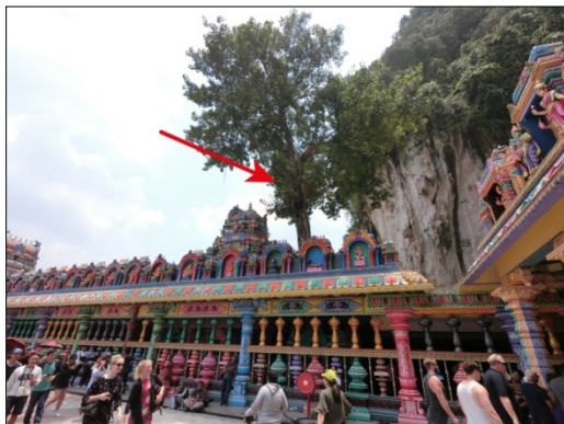
Figure 10: The sacred tree at subdivision of the temple.

The worship tree is located at the new subdivision temple (see Figure 10 and Figure 11). Previously the sacred tree is stand-alone at the exterior area but now the committee builds a subdivision-roofing temple with major upgrading renovation as contributed by the donation from society and visitors. The sacred tree believed connected to the god of “Sri Nagaraja” in Hinduism. As society’s belief, the tree is the shelter for the spirit of “Sri Nagaraja”.