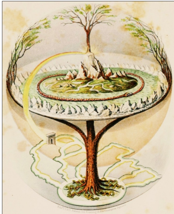
Figure 1: Symbolic Representation of “World Tree”.