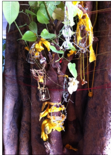
Figure 13: A marking of wishes.