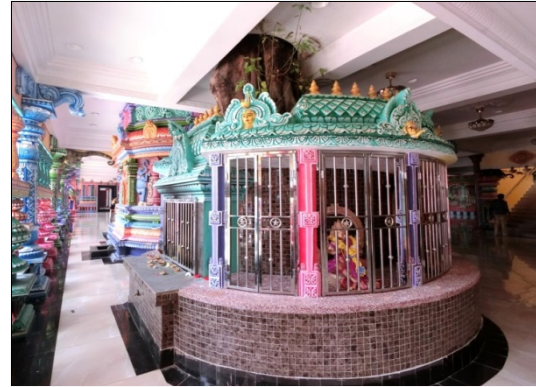
Figure 11: The sacred tree in the temple.

Generally, trees considered friends of human as they provide us shelter, food, fuel, and oxygen for good living. The worship tree is the ‘Vilva’ types of a tree as the only tree that have uniquely three-pronged leaves that sprout together like a trident. He also claimed that the leaves of the worship tree as ‘Vilva’ type can be the function to relief the diabetics disease and the pulp of the fruit can heal diarrhea. The fruits from the tree are called ‘Bel’ and was a favorite fruit of Lord Shiva; the Supreme God within Shaivism, one of the most influential denominations in Hinduism (Sharma, 1996).