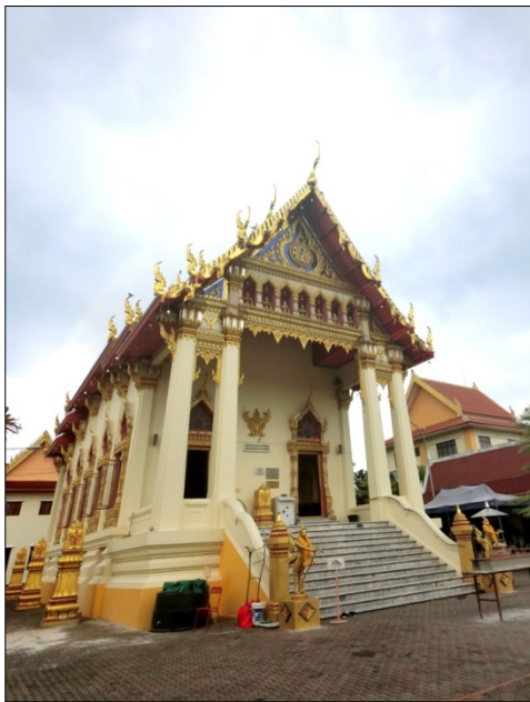
Figure 6: “Wat Chetawan”.

Buddhism. There is a worship tree which belief in animism in Wat Chetawan (see Figure 6), a Thai Buddhist temple located in Gasing Road, Selangor. The interview was conducted on 21 st June 2015. Interview explained that the worship tree at Wat Chetawan is a Bodhi tree which is sat behind the temple building. Figure 7 shows the view of the worship tree as the Bodhi Tree. The Bodhi tree of Wat Chetawan is believed to have supernatural power to overcome the devotees or believer mind when they practice meditation on the surrounded platform. Somehow, the Bodhi tree will calm down them in belief that will give protection and life problem solution.