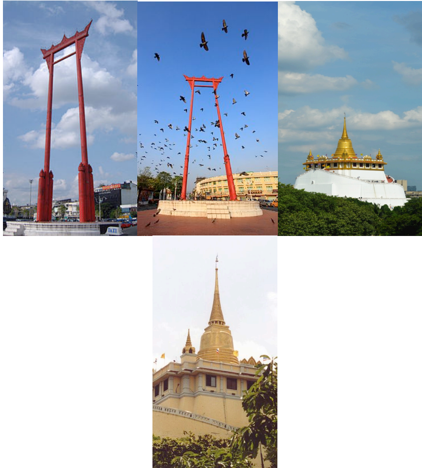
Fig. 1 Ex. Picture of the landmark in Bangkok.

Through convey the content as graphics or illustrations in the design. The research results obtained from the analysis can be adapted and applied as a design guideline in different situations. And the important is tell the historical story about each community, and also promote local culture and create the local identity.