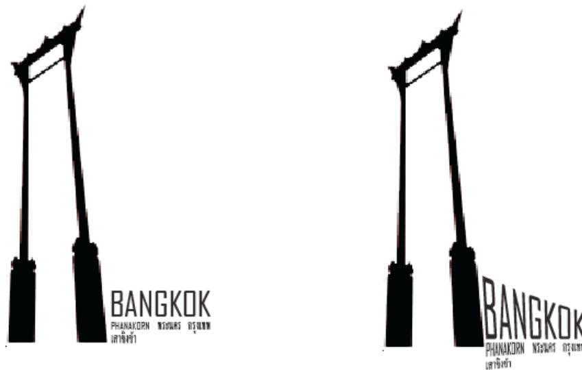
Fig. 4 Ex.Illustration of Giant Swing. (Sao-Ching-Cha)

Sample design keeping in mind that the format that will be used in the design. The use of light and shadow to the appeal letter to find the meaning of the images, and placement. Accompanying text, photos or graphics place to offer an extraordinary view. Do both two-dimensional and three-dimensional assemblies, see virtual. Details of the most notable. Other components the least made more attractive and create questions of the witness. The difference in the color of a novelty to see a harmony causal relationship. Technique, storytelling and visual narrative makes it easier to comprehend.