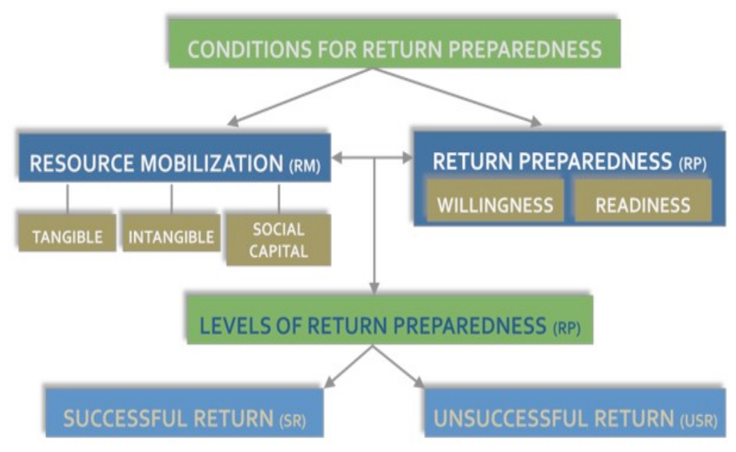
Figure 2: Operational Framework

have developed during the migration process. "These are relations established prior to migration which the migrant was able to maintain through the migration experience, of whom the migrant believes can still help and facilitate his return home. These are beneficial relationships and "resources provided by the returnees' families or households." (Cassarino, 2004) Return Preparedness not only asks whether the migrant is willing to go home, but also asks whether the migrant is ready to go home.