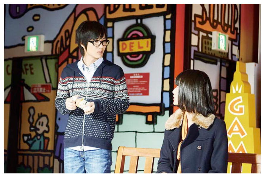
Figure 2: The encounter between Kasumi and Maeda at the cinema

Maeda and Kasumi are alone for the movie and meet one another. They have a chance to chat, yet they feel shy and awkward. At school, they are classmates, but rarely have a chance to chat. Maeda does his best to break the ice by turning the conversation to film, which is what he likes. On the other hand, Kasumi talks about the past in which they have known each other since junior high school days. Maeda is glad that Kasumi still remembers him, which makes she laughs saying "Why not?" After the conversation, they go on their way.