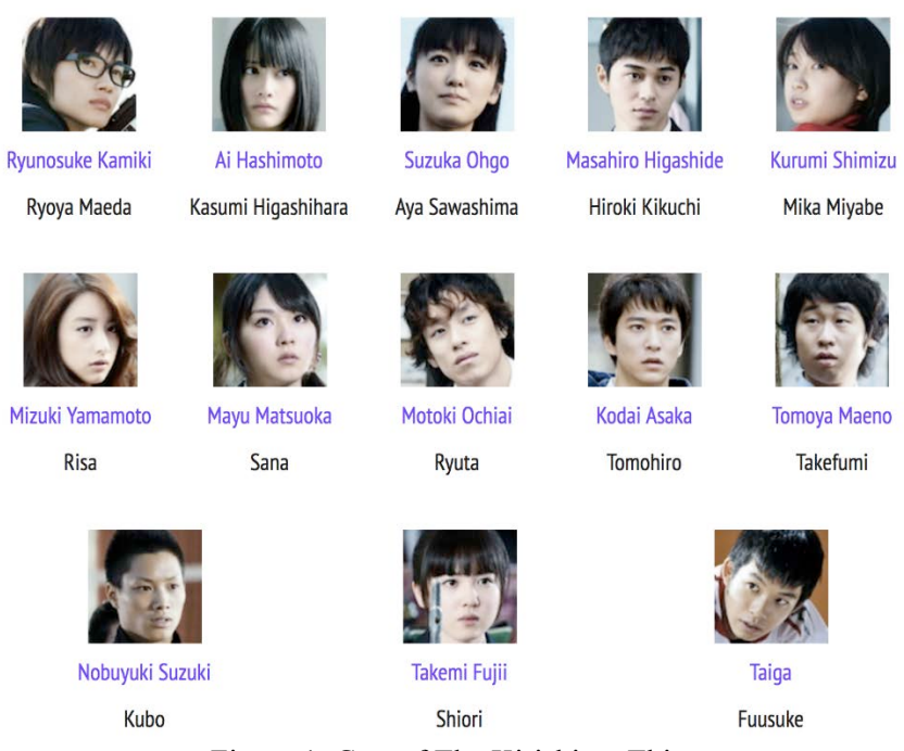
Figure 1: Cast of The Kirishima Thing