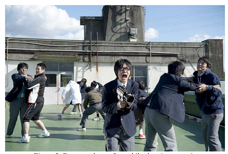
Figure 3: Event on the rooftop while shooting a movie

The unseen space of relationship between the two has narrowed down from perfect strangers to be old friends. The space for their meeting is changed from the school to the cinema. This means that the influence of a place impacts not only the way characters interact, but also space of relationship known as physical space as well as psychological space. This also makes a difference for the way characters behave and act (Paninya Paksa, p. 106).