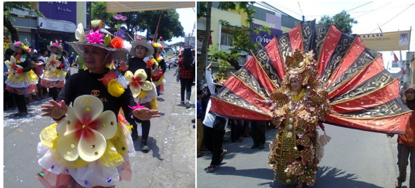
Figure 2: Tourism “modernizes” Javanese communal ceremony

Global interaction (Appadurai, 2010) surely contributes to spread the idea of capitalist practices. Furthermore, in Culture Matters (Harrison-Huntington, 2000) Linsay confirmed that economic growth will be achieved when the engines of growth encourages the productive use of the nation's resources. In this particular case, the Indonesian government makes use of the Javanese traditional teachings for the sake of benefits for modernity. Consequently, the Javanese communal ceremony has a new casing, mainly to accommodate tourism purposes. The “development” leaves the soul of Javanism which was embodied by traditional Javanese people through local tradition. The soul has been separated from the body, and as such, the Javanese communal ceremony is slowly dying (Figure 2).