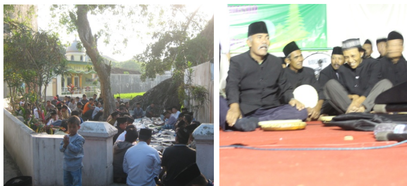
Figure 5: Traditional communal activity (left, 2013) and the religion-influenced activity (right, 2014).

The costume worn by the men who participated in the 2014 communal ceremony showed that the expansion of the mainstream religion, Islam, has a great role in renouncing the Javanese traditional culture. This is the transformation of the 2013 traditional ritual in which all the people are equal. Egalitarian can be viewed from the way the people dress and the age of the participants. Additionally, the traditional Javanese collective activities such as communal gathering that used to take place near the spring, the grave of the ancestor, and under a big tree, have changed because of the influence of religion as one of the components of modern power (Figure 5).