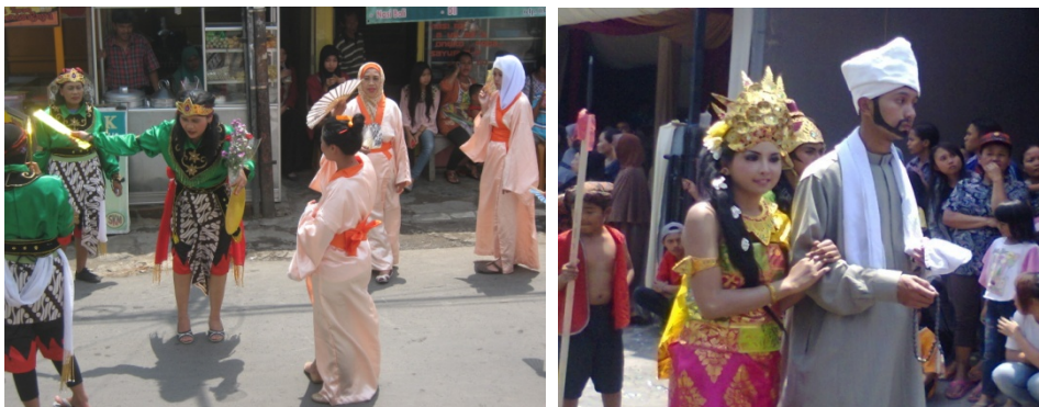
Figure 3: Crossing border.

Barker (2000, p.11) emphasized that cultural invasion conquers each unit of the way of life “includes the generation of meaning through images, sounds, objects, and activities”. In terms of objects, he referred to clothes as one of the manifestations of cultural invasion. This tendency can also be found in Opak-opak tradition held in 2014 compared to the ceremony in 2013. In 2013, the carnival in Landungsari village articulated the fluid Javanism trait by putting the harmony of the traditional and the modern one. This marks the happening of “crossing border”, where the traditional culture can be hand-in-hand with modernity (Figure 3). However, in 2014, this depiction of accommodative notion was totally changed (Figure 4).