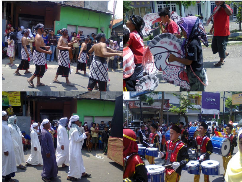
Figure 4: The change because of mainstream religion invasion.

The images on the top depicted the carnival in 2013 which still involved the traditional costumes, whereas the images on the bottom from the carnival in 2014 showed that the traditional costumes were denied.