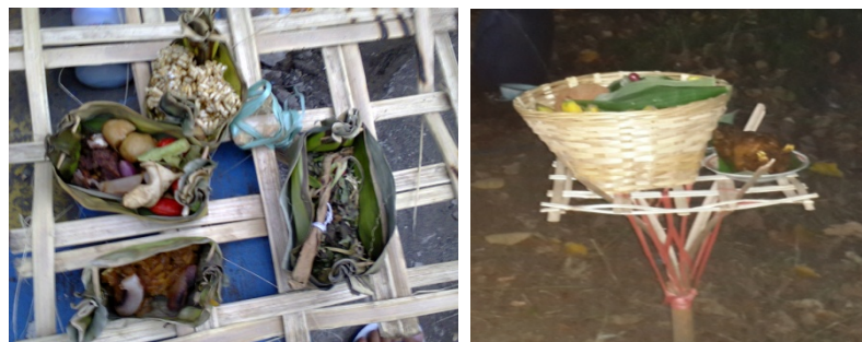
Figure 6: The spirit of Javanism.

Interestingly, discussing the invasion of the power which always relates to superiority of authority or leadership and inferiority of subordinate or powerless group, there is no apparent conflict. The dichotomy of Javanism teaching, which makes the internal factor, also contributes in undermining the Javanese communal ceremony. Javanese people always willing to compromise as a collective group, including to welcome all religions – to mention in Indonesia, it covers Hinduism, Buddhism, Islam, Christianity and other beliefs. This is in the line with Javanism traits which are fluid and accommodative. In this particular case, the government makes use of this compromising attitude for the sake and benefits of modernity. Thus, the heart of Javanese communal ceremony becomes nearly extinct because the ceremony itself becomes a marketable event rather than a spiritual rite. Offerings (Figure 6) are the first priority that once inherently attached to Javanese people in expressing their gratitude to God's gift has been abandoned. It can be concluded that the Javanese communal ceremony is now resides in a disavowed position.