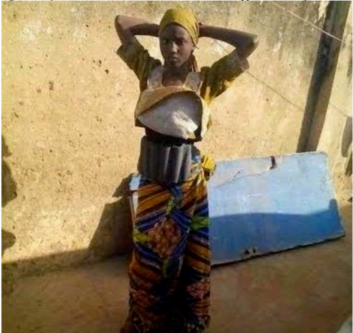
Fig. 2: A 13-year old arrested in Kano, with suicide belt strapped to her body