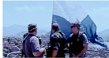
Figure 2: Frames of Complexo do Alemão and of the army training

The chapters, displayed from Monday through Saturday, were, in average, 75 minutes long. The telenovela has been exported to many countries, including Portugal and African countries, where Globo Network already has partnerships serving their entertainment products.