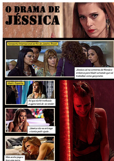
Figure 5: Image of the comic book: “The Drama of Jessica”

To keep the memory of the character alive and to extend the dynamic possibilities of interaction with fiction, Globo published on the telenovela website the stylized story in comics format (Figure 5), with the following title and helpline: "The Drama of Jessica: review the story of the trafficked girl in comics". "Blonde fought hard alongside Morena and ended up being murdered by Livia".