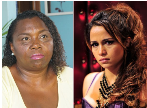
Figure 3: Trafficked women: in real life and in fiction