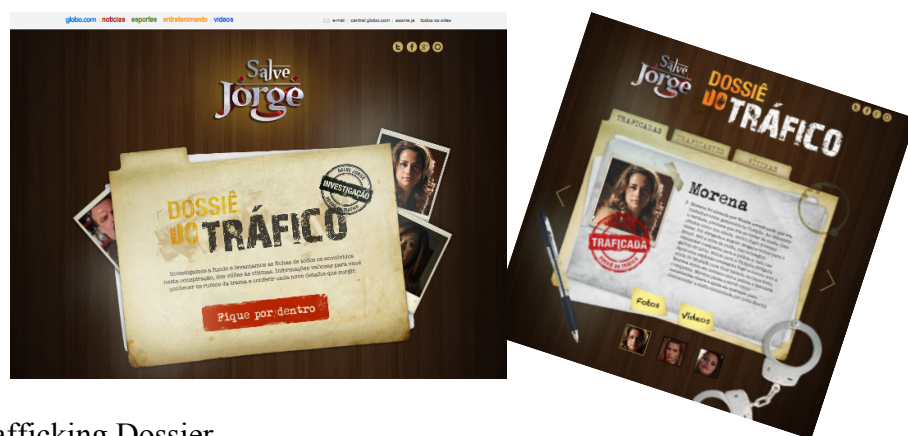
Figure 6: Trafficking Dossier

According to the people responsible for production of content, there are three categories of bonding: trafficked, traffickers and victims. The website provides a brief overview of the profile of each character involved in the trafficking and complements the content with photos and videos.