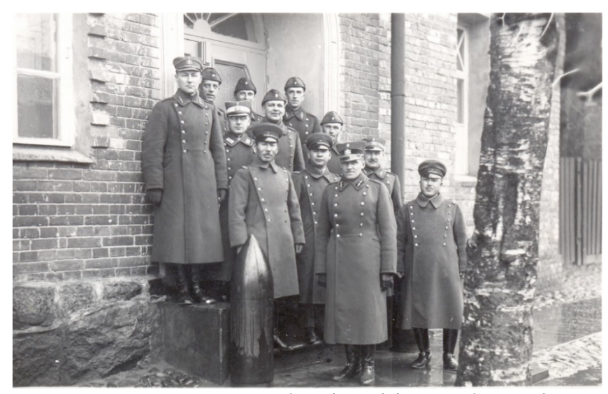
Figure 4. Japanese Army Delegation visits Cavalry Regiment of Latvian Army in Daugavpils, Latvia. (April 1935) Lieutenant Colonel Tsutomu Ouchi<sup>4</sup> (first from the left, second line) is confirmed.

From May to June, fifty 6.5mm bullets for the Arisaka M1905 and one-hundred 8mm Nambu bullets were delivered to Estonia. (JACAR, Ref. C01004067100). In June, five-hundred Nambu bullets were additionally supplied by Lieutenant Colonel Taketo Kawamata, Military Attaché to the Japanese Embassy in Moscow, who used to be Ouchi's superior at the Riga Legation until July 1933. (JACAR, Ref. C01006855500)