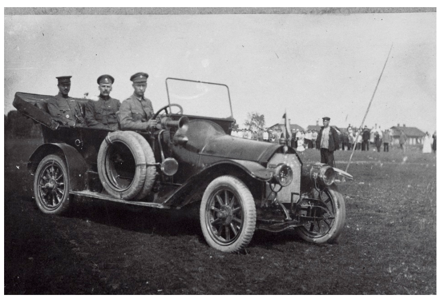
Figure 2. In Summer 1919, amidst the Estonian Independence War, Colonel Jotaro Watanabe, Military Attaché of Japanese Legation in the Netherlands, visited Narva, border town between Estonia and Russia, and inspected the Estonian 4<sup>th</sup> regiment.

However, Japan had to wait until late 1930s to realize the actual military cooperation due to the political unrests of the Baltic States.