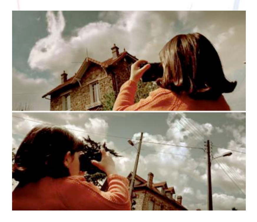
Figure 1: Productive look of young Amelie, screenshot from the film.

When Amelie was a child, she was not totally affected by her society's visual regime. Like the other children she has the ability to see things the adults do not notice. When she gets a camera as a present, she captures details that represent a productive look. Kaja Silverman takes camera and gaze together and defines it like a social lens which is always upon the subjects. However, Amelie's camera functions different than the gaze while she is a child and do not watch the world from the screen like the others do. Since she discovers animal figures in the clouds; a teddy bear and a rabbit when she looks through her camera, (See Figure 1) the photos she takes expresses her productive look. Kaja Silverman (1996:160) says, "I know even as I look and even as I see, I am changing what is there". For her the look is always shadowed by our feelings, fears and desires and in this society of spectacle all are mediated by representations. All people have the ability to transform what they see but in order to avoid the coercive ways of seeing implemented by the society Silverman suggest to gain a productive look. Perceiving the world with a critical eye and not accepting the visions provided by the society without questioning, can be regarded as the idea underlined by the main character Amelie.