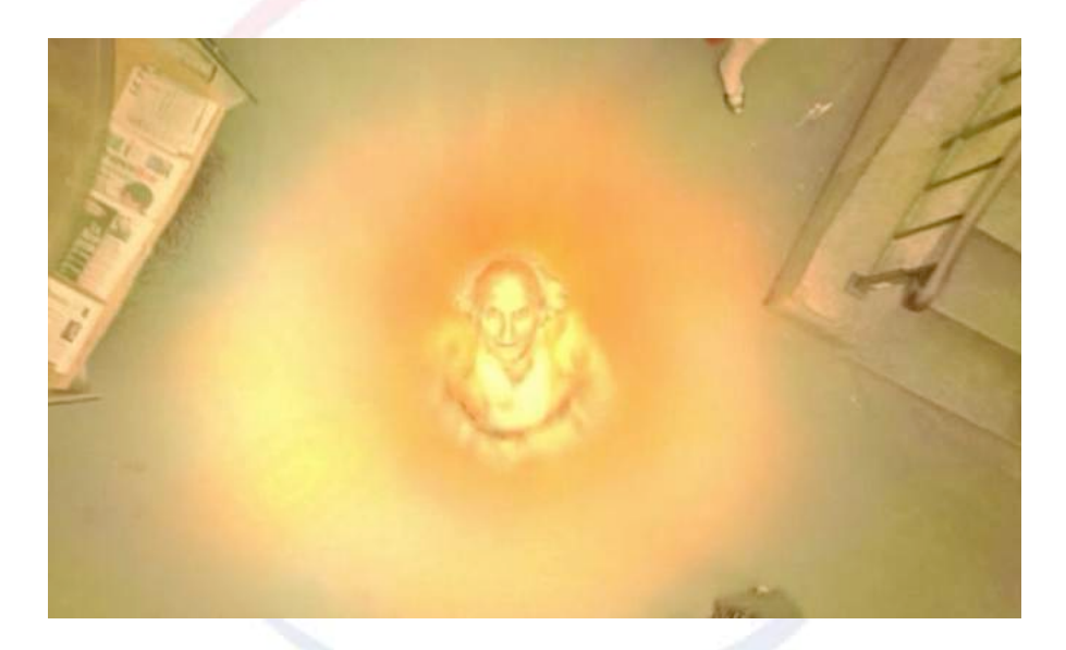
Figure 3: Blind man seeing with the words of Amelie, screenshot from the film.

Including a blind man (Jean Darie L'aveugle) in the film is not an arbitrary choice. It can also be read as a comment on seeing and looking. Despite all the visual impact, particular color tones selected by art direction and multiplicity of visual elements in the film, the blind man's sight represents lack of visuality. His presence, reminds one another aspect of seeing: sightlessness. He does not have an ordinary access to the field of vision therefore the cultural screen might works in a different manner for this character. In the film Amelie helps this senior blind man to cross the street. On their way walking together she described every ordinary thing she saw on the street becoming the eyes for the blind man. It can be interesting to wonder what the blind man made out of the sentences he hears. How he made sense of the immaculate details of vibrant scenery he has never experienced. I think the "look" of his mind that is not affected by the visual regime of the society, can be considered as productive look. To make this moment a surreal one that represents the joy of the blind man who have been captured in darkness, a specific camera movement and supplementary special effect is used to show him surrounded in a brilliant magical glow (See Figure 3). As if Amelie brought color to his dull life.