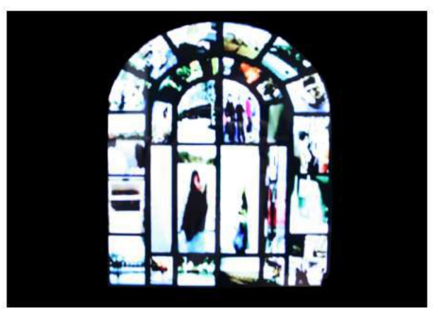
Example 1: Memory Cathedral (2011)