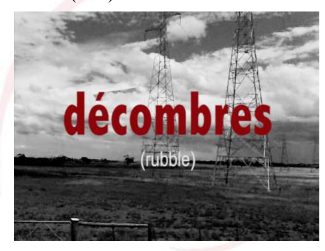
Figure 2: "Decombres' (2014) production still, Dean Keep.

In the case of Decombres (2014), the aim of this project was to repurpose and construct a digital story using existing video and text messages stored on my smartphone. In Decombres, it's title aptly taken from the French word for rubble, the project adopts bricolage techniques as a production methodology. Working only with digital artifacts stored on my smartphone, video footage from a long forgotten train trip to a country town and remnants of text messages form a series of conversations with a friend over the past 5 years were used as source material to construct an experimental documentary narrative.